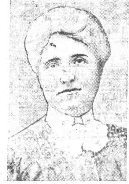
Degree of Honor.