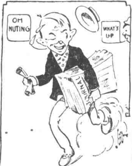
Why Were Journals Delivered Early?

The Journal Carriers' association and the Journal band gave an excursion last night on the steamer Joseph N. Paul, of the Open River Transportation Company. Dancing was enjoyed on the