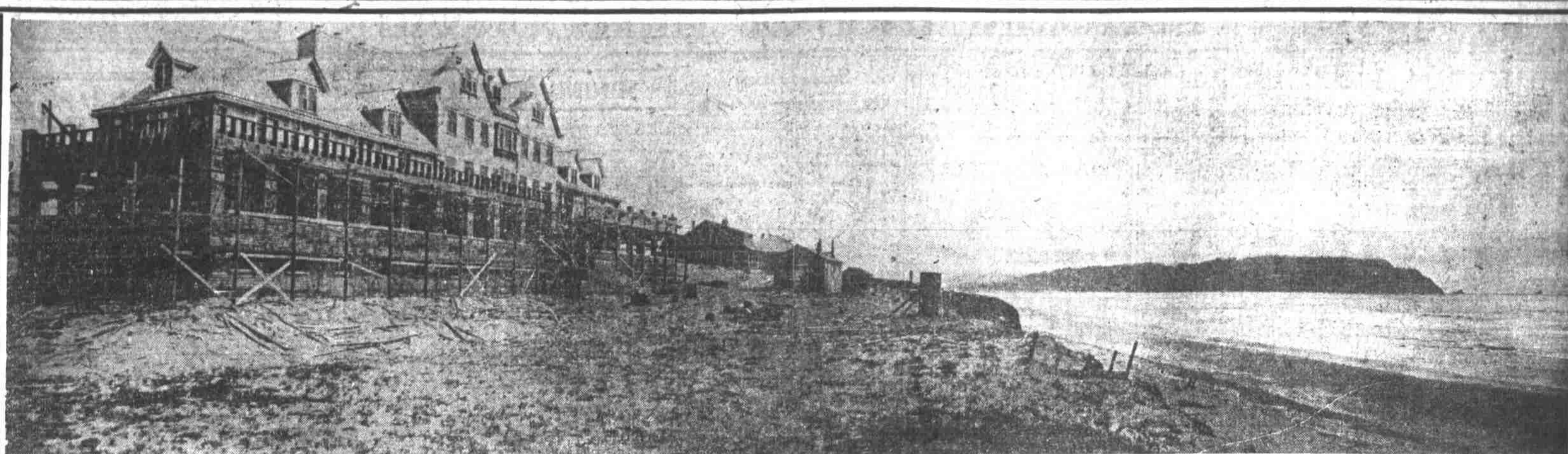
VIEW OF THE NEW HOTEL, FACING THE BEACH AND OCEAN AT GEARHART PARK, OREGON'S BEAUTIFUL RESORT