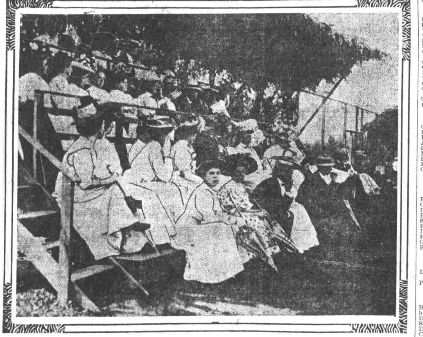
Watching the Play at the Irvington Tennis Courts.