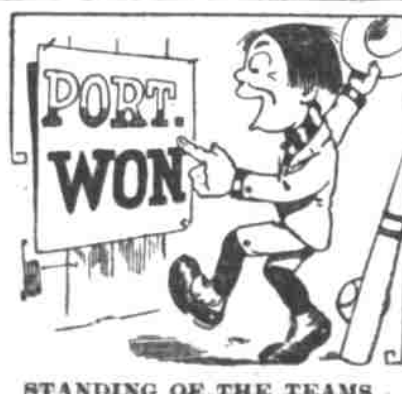
STANDING OF THE TEAMS.