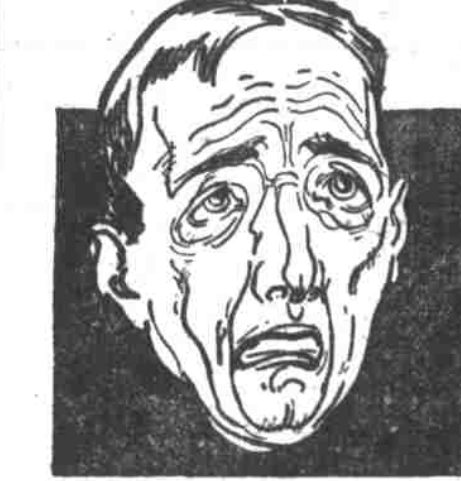
The above illustration plainly shows what a few days use of Gause's Catarrh Remedy will do for any sufferer.

In order to prove to all who are suffering from this dangerous and loathsome disease that Gause's Catarrh Cure will actually cure any case of catarrh quickly, no matter how long standing or how bad, I will send a trial package by mail free of all cost.