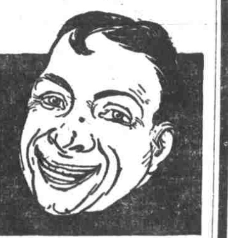
The above illustration plainly shows what a few days use of Gause's Catarrh Remedy will do for any sufferer.

In order to prove to all who are suffering from this dangerous and loathsome disease that Gause's Catarrh Cure will actually cure any case of catarrh quickly, no matter how long standing or how bad, I will send a trial package by mail free of all cost.