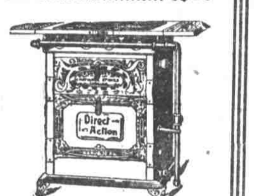
Notice this style has broiler above the oven. The oven fire and broiler fire separate and in plain sight. Price, including connection, to your stub, $31