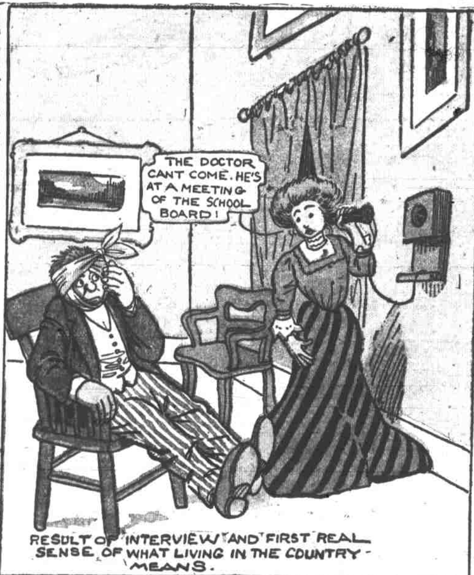
RESULT OF INTERVIEW AND FIRST REAL SENSE OF WHAT LIVING IN THE COUNTRY MEANS.