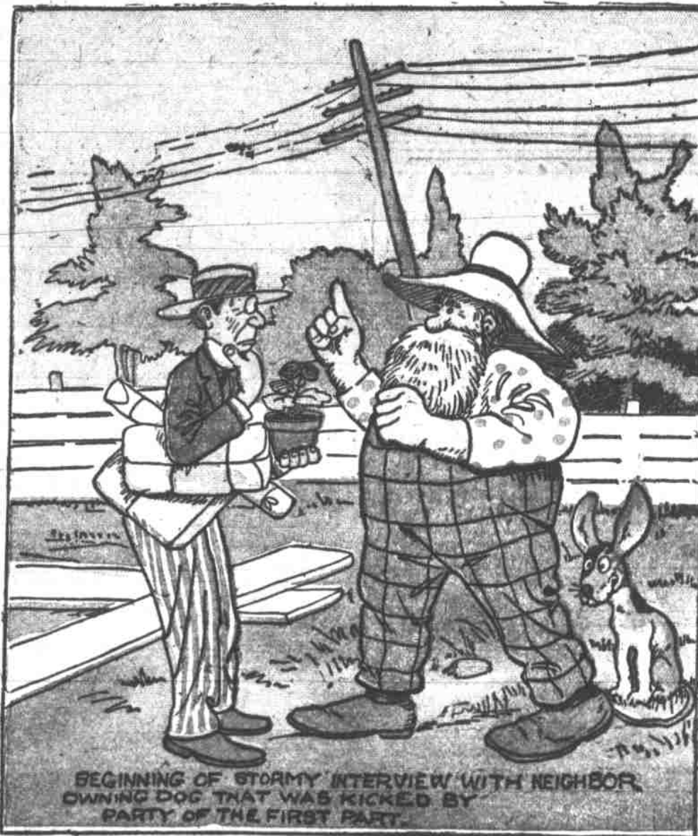
BEGINNING OF STORMY INTERVIEW WITH NEIGHBOR, OWNING DOG THAT WAS KICKED BY PARTY OF THE FIRST PARTY.