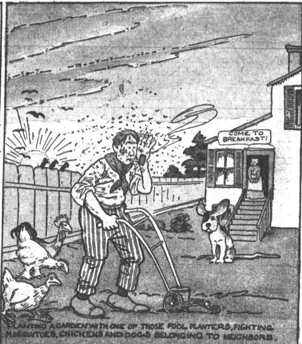
PLANTING A GARDEN WITH ONE OF THOSE FOOL PLANTERS, FIGHTING MOSQUITOES, CHICKENS AND DOGS BELONGING TO NEIGHBORS.