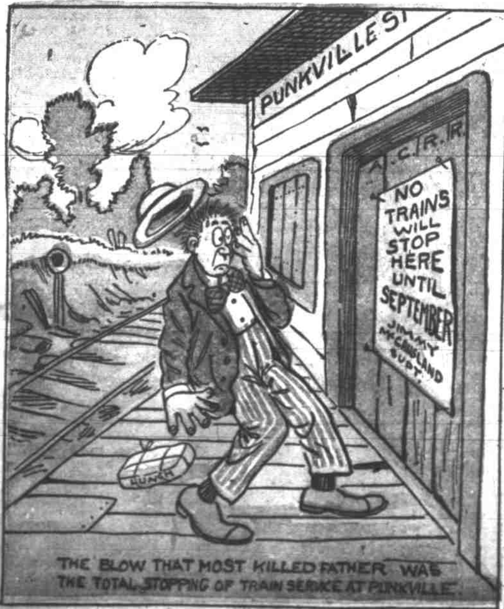
THE BLOW THAT MOST KILLED FATHER WAS THE TOTAL STOPPING OF TRAIN SERVICE AT PUNKVILLE.