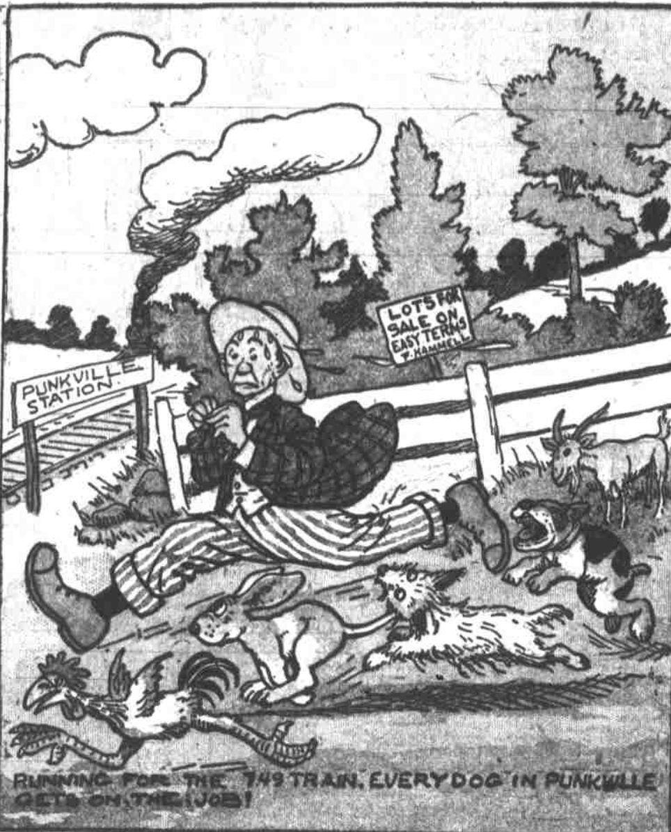
RUNNING FOR THE TRAIN, EVERY DOG IN PUNKVILLE GETS ON THE JOB!