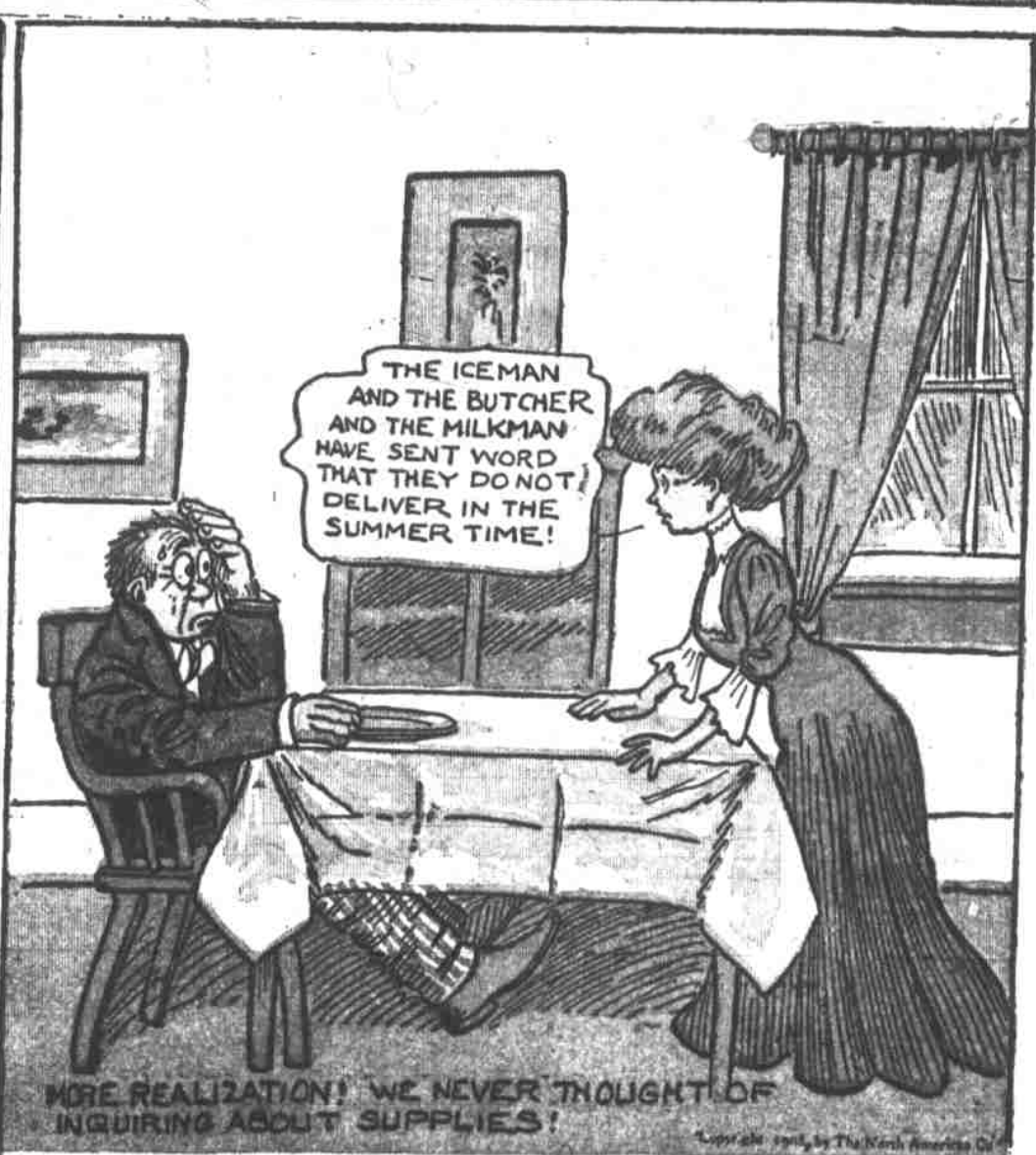
MORE REALIZATION! WE NEVER THOUGHT OF INQUIRING ABOUT SUPPLIES!