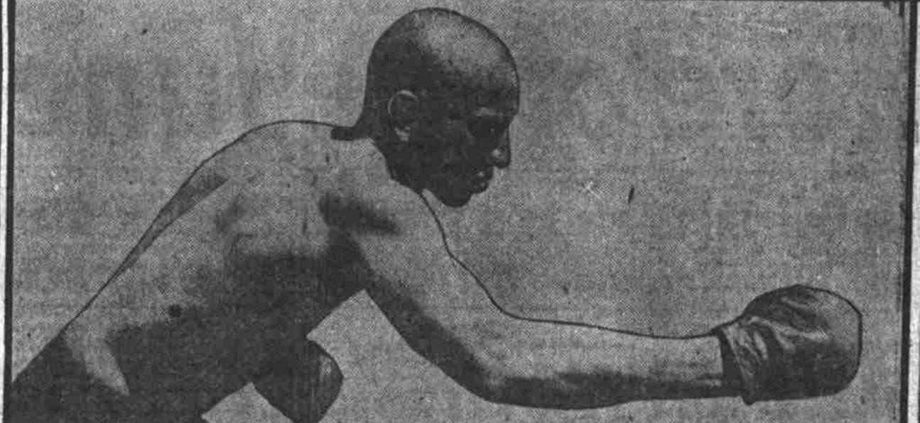
CHAMPION JOE GANS