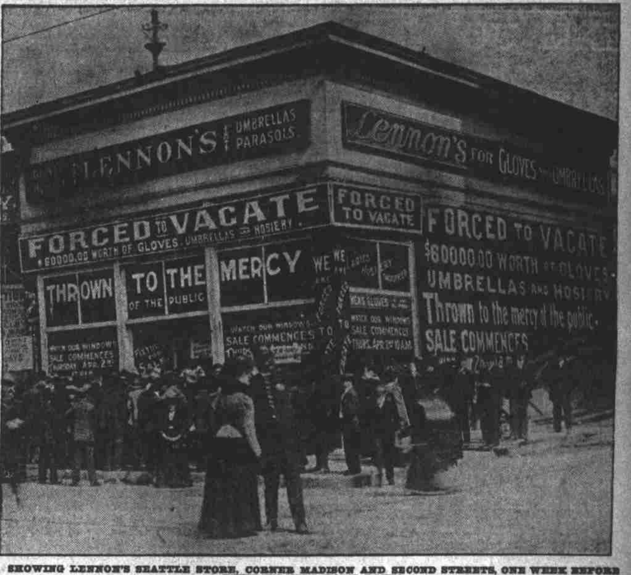
SHOWING LENNON'S SEATTLE STORE, CORNER MADISON AND SECOND STREETS, ONE WEEK BEFORE BUILDING WAS TORN DOWN.

Sale commences tomorrow (Tuesday) morning, June 23—9 o'clock.