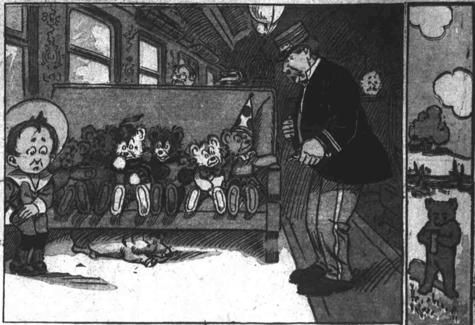
2. You can imagine the surprise That here meets the conductor's eyes. The Teds are scared, and Johnny, too, While piggy hides himself from view.