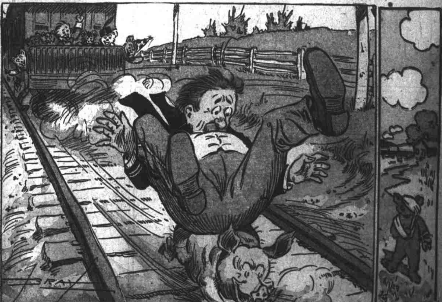
6. Just how this happened we don't know, But down the track they madly go. The papers said in letters big, "CONDUCTOR'S KIDNAPPED BY A PIG!"