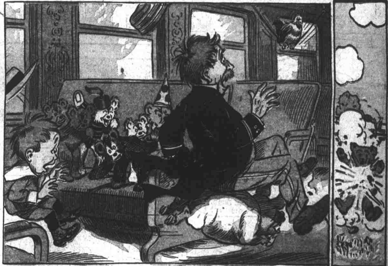
4. Old biddy hen, with one fell flop, Has signaled for the train to stop. This scares the pig beneath the seat, And he leaps forth with all his feet.