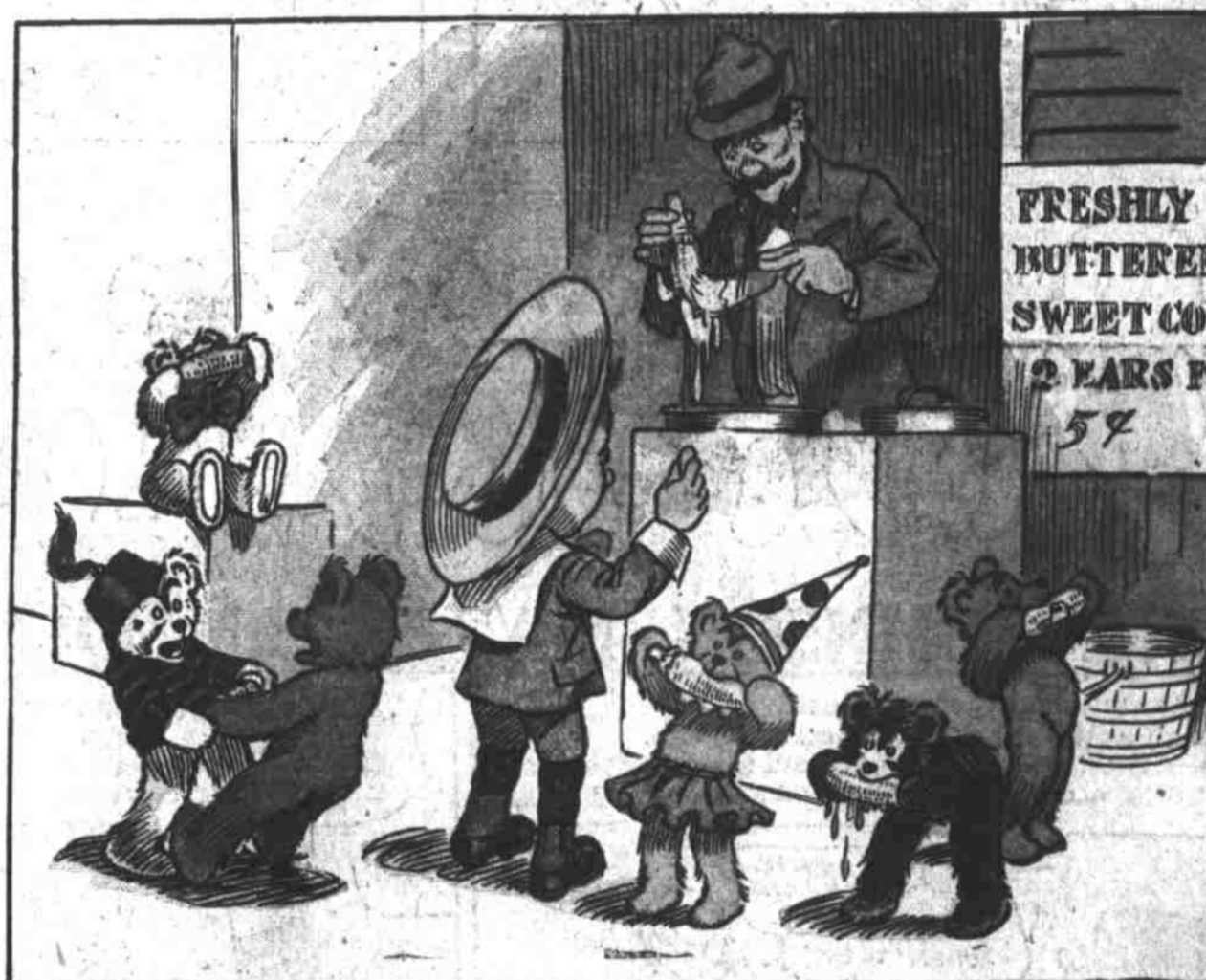
4. And next they eat—such hungry imps!— Cakes, candy, peanuts, whole fried shrimps. And last upon sweet corn they fall, And bolt it down, corn, cob and all.