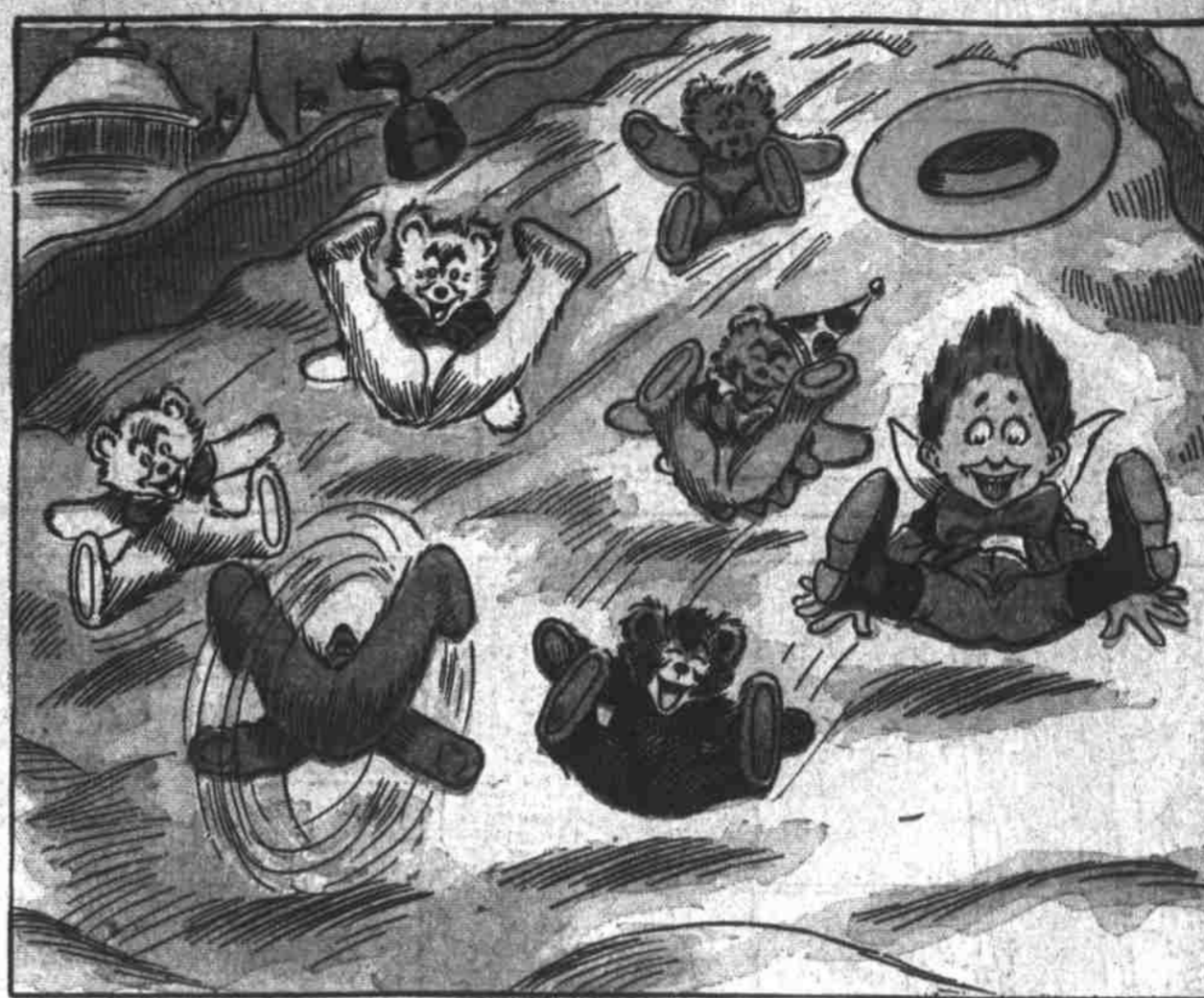
2. And first they try the "Bump-the Bumps, A smooth hill full of funny humps. O'er the lumps they slide with shrieks, And laughingly land below in heaps.