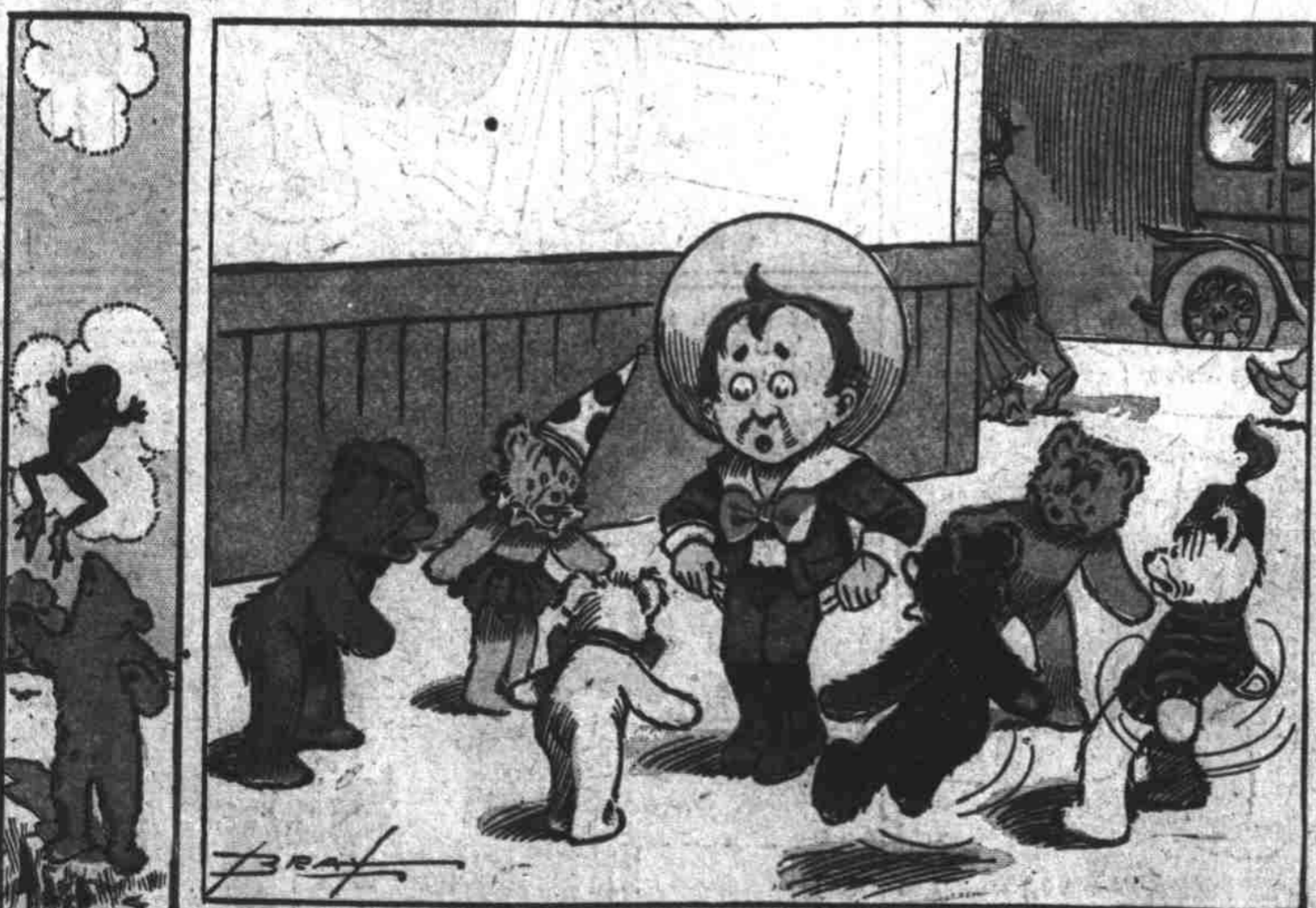
5. And now the glorious day is done. What loads and heaps and stacks of fun! But why these looks disconsolate? In the next verse we'll plainly state.