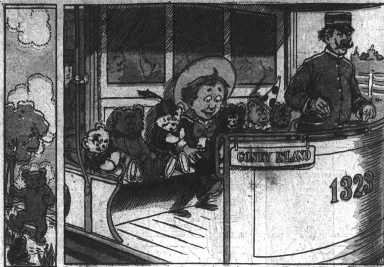
1. How happy now the Teddies are Aboard a Coney Island car, And speeding to the place renowned Where gayety and noise abound!

PORTLAND, OREGON, SATURDAY EVENING JUNE 13, 1908