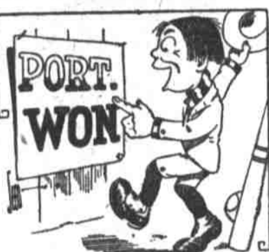
STANDING OF THE TEAMS.

Tomorrow and Wednesday will be positively the last days for discount on west side gas bills. Portland Gas Co.