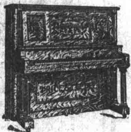
Price & Teeple, Style 28 The principal features of this piano are the architecture of its case as well as its beautiful tone.