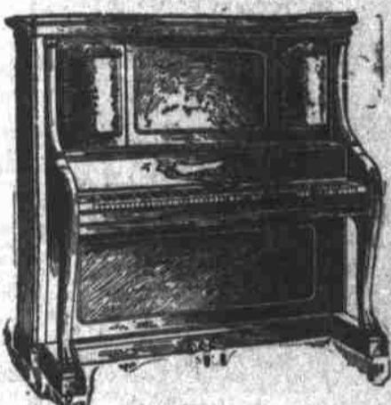
Wegman Style This particular style, in quarter sawed oak, is one of the most popular instruments on the market today.