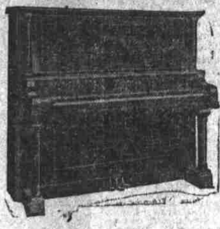
Milton, Style D A medium-size instrument in a beautiful mahogany case. A favorite of the average buyer and a credit to any home.