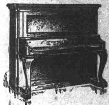
Wegman Style An instrument that is made to meet the demands of the most critical buyers. The Wegman piano is one of the best known makes in use.