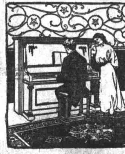
Wegman Player Piano Selections from the greatest artists can be rendered in your home on this instrument without a musical education.