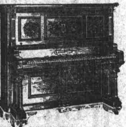
Cabinet Grand — Style K. For the small sum of $137 you will get this beautiful piano and it is guaranteed to give perfect satisfaction.