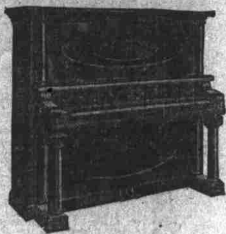
Milton, Style E A better piano for the money could not be found. This one is especially designed for a small room.