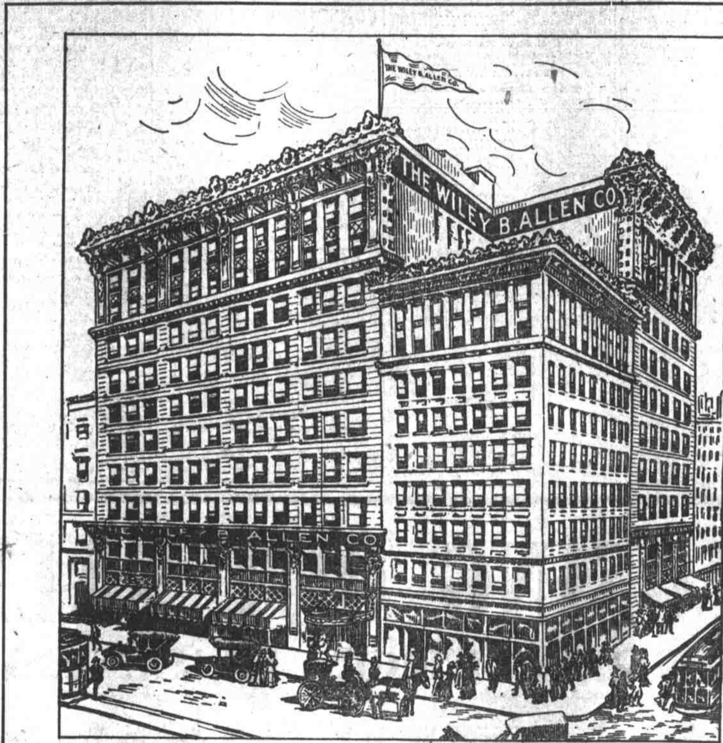
The new headquarters of the Wiley B. Allen Company, now under way of construction at the corner of Kearny and Sutter streets, San Francisco. One of the largest establishments in the world devoted exclusively to the sale of pianos.