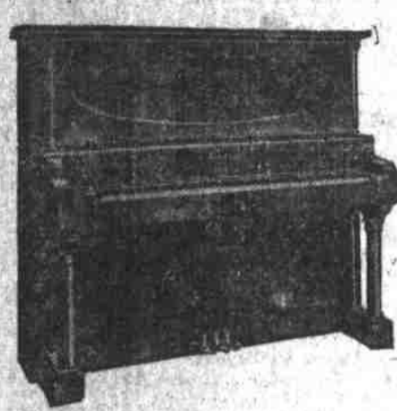
Milton, Style C The largest size in this make with tremendous volume of tone, but clear and sweet in the extremes.