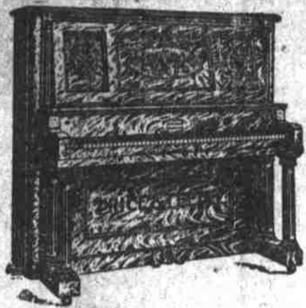
Price & Teeple, Style 25 This is a pretty little piano and a great favorite of all who see it. It's tone is exceptionally fine.