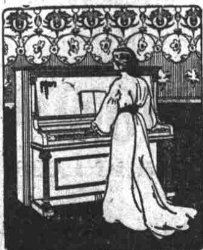
Price & Teeple Player Piano This instrument has the player built on the inside and can be used in the ordinary way or by foot power.