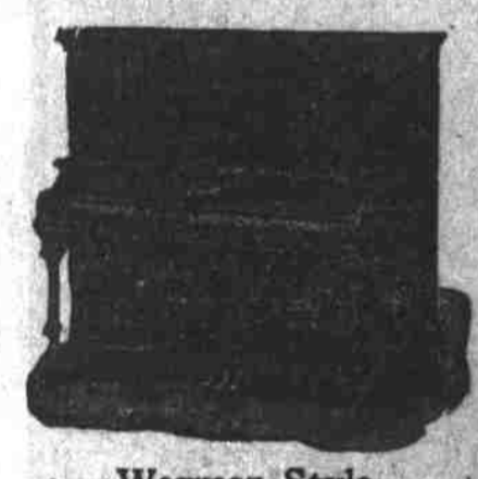
Wegman Style This little piano stands four feet and five inches high, but has full length keyboard and duet bench.