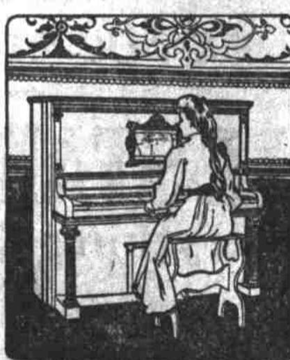
Milton Player Piano In appearance cannot be told from the ordinary upright piano. Can be operated with music rolls or in the usual way.