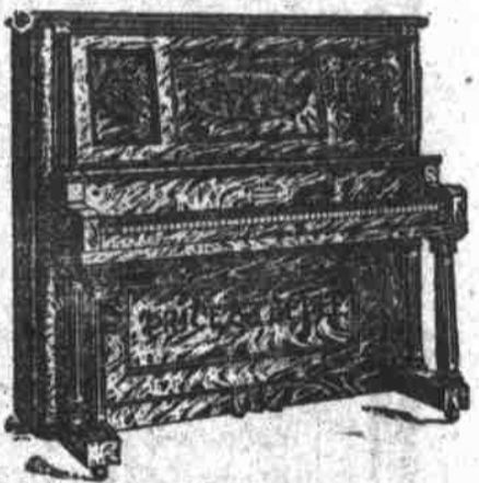
Price & Teeple, Style 44 This one has a more elaborate case and takes the eye of everyone who sees it. Tone unexcelled.