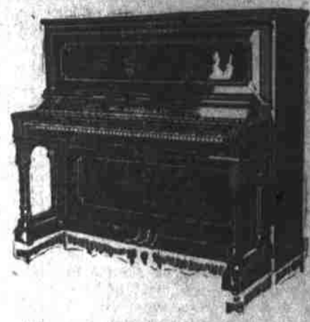
Mason & Hamlin, Style O In this instrument you have the world's best piano, the largest size, in plain but beautiful case. The highest type of piano perfection and will tell its own story.