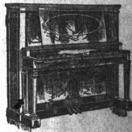
Upright Grand — Style S. Regular price ..... $175 Special price now ..... $135 This shows what the co-operative plan will do for you.

After you have made your selection you will not only be given the instrument at a rock-bottom wholesale cost but you will also get an exchange agreement, signed by us, which practically places the piano in your home for one year on approval, as you will be entitled to the privilege of exchanging for any other of our various makes within one year from date of purchase, and in such exchange the full purchase price or all money paid at that time will be applied on the instrument of your second choice. Our motto is, and ever has been, satisfaction to our patrons or money back. There is an ironclad guarantee from the factory of from ten to twenty years, backed up by ourselves, which will accompany each piano. As a whole, we take all the chances and the purchaser none whatever. Cut out the coupon in the lower right-hand corner, fill in the name and address, mail it to us, and full particulars of our unprecedented plan will be furnished you at once. See reader on this same page.