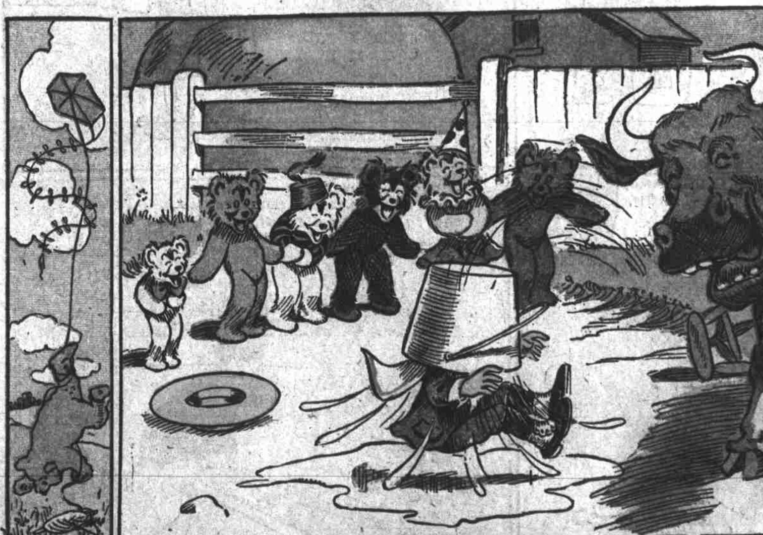
5. The Teddies yell at Johnny's plight, And even old Boss laughs outright. But Johnny's probably thinking that He doesn't like a milk-pail hat.