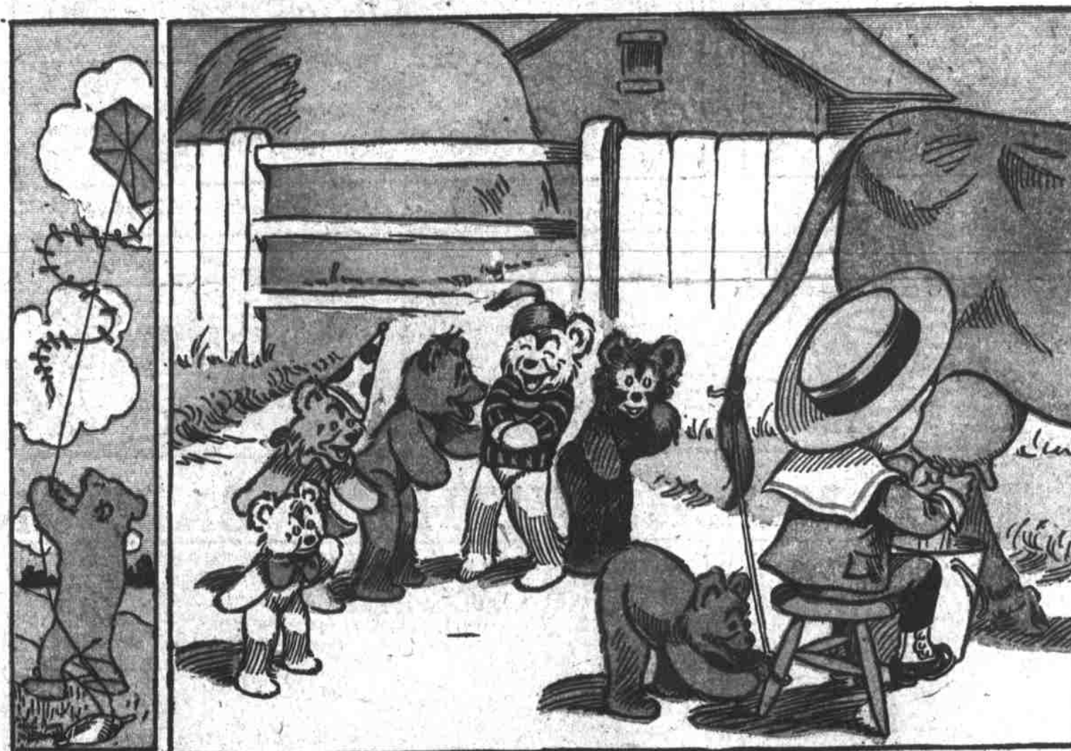
3. They saw a rope and could not fail To note it looked like the cow's tail. Tying tail to rope, then, as we view it, They had to tie the next thing to it.