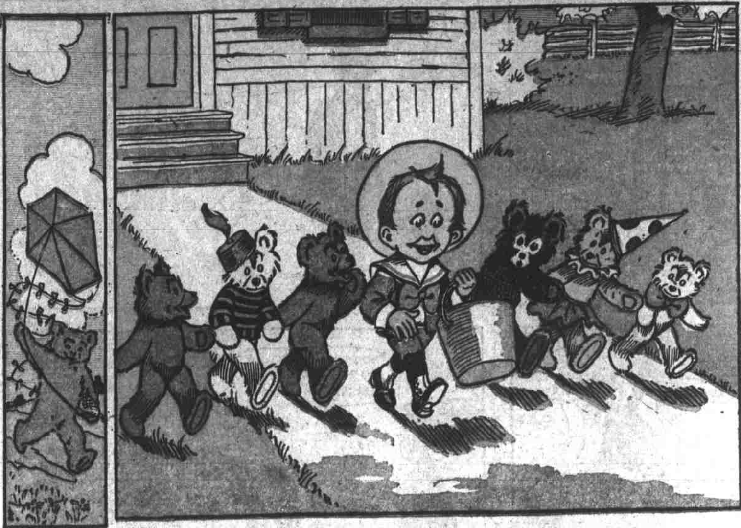
1. How happy John and Teds are now! They're going out to milk the cow. So eager to see how it's done, The Teds are going on the run.

PORTLAND, OREGON, SATURDAY EVENING JUNE 6, 1908