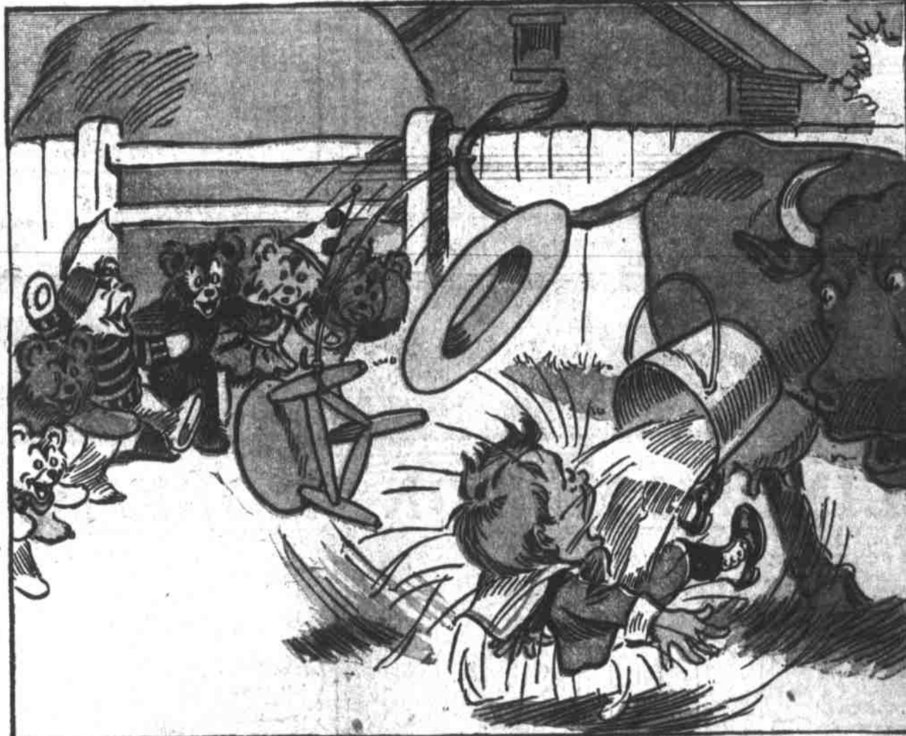
4. Of course, when old Boss switched her tail She upset Johnny and his pail, Unhappily, John's head and face Just now are wholly out of place.