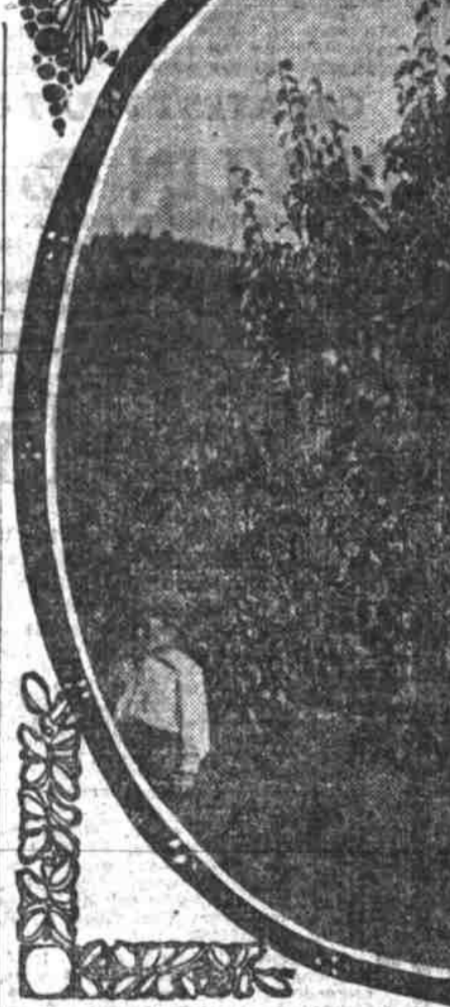
A PEAR TREE IN FULL BLOOM.