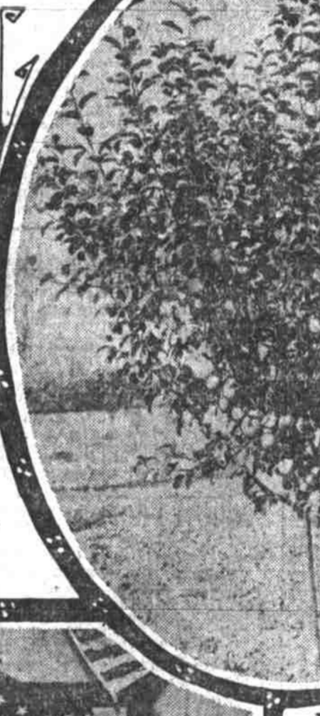
A FOUR YEAR TREE