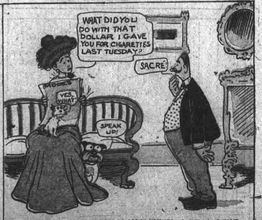
AND YOU CAN SAY ANYTHING YOU LIKE TO A REAL DUKE