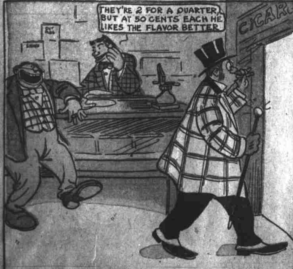
YOU CAN PAY ANYTHING YOU LIKE FOR YOUR CIGARS.