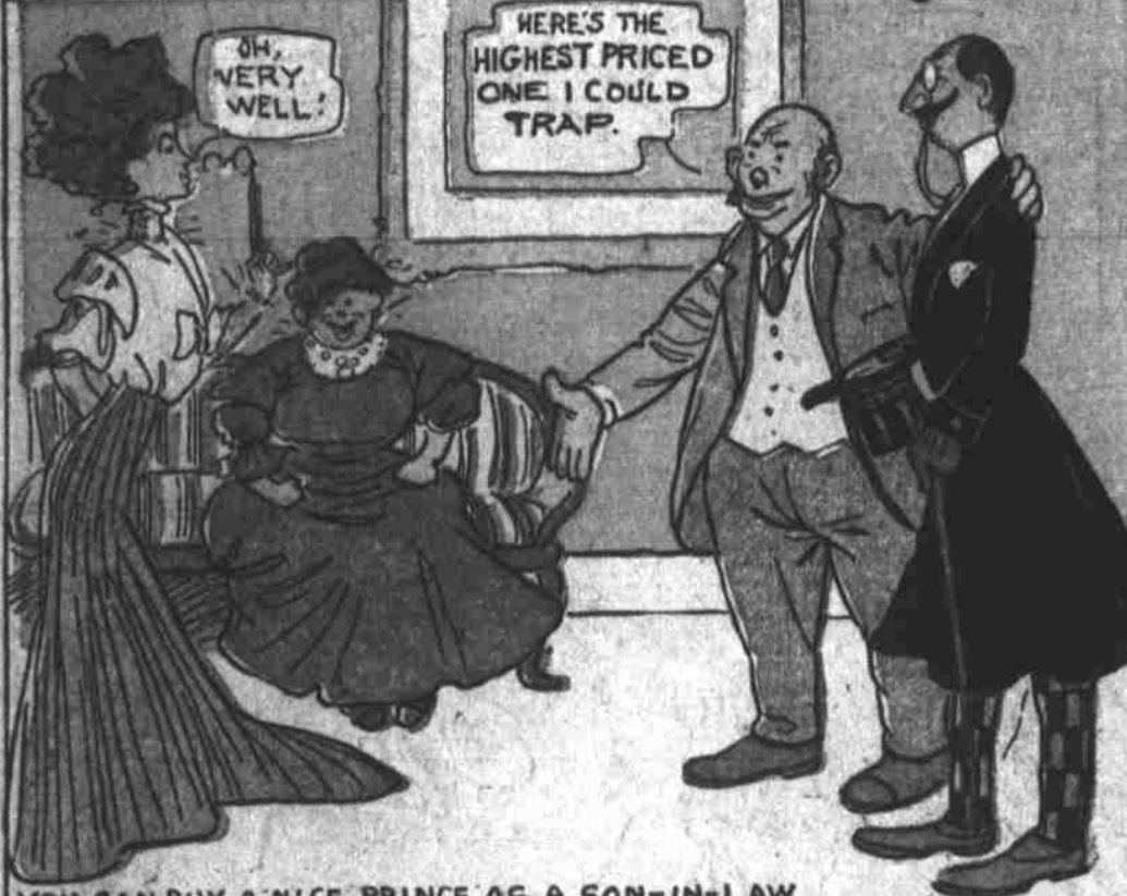
YOU CAN BUY A NICE PRINCE AS A SON-IN-LAW