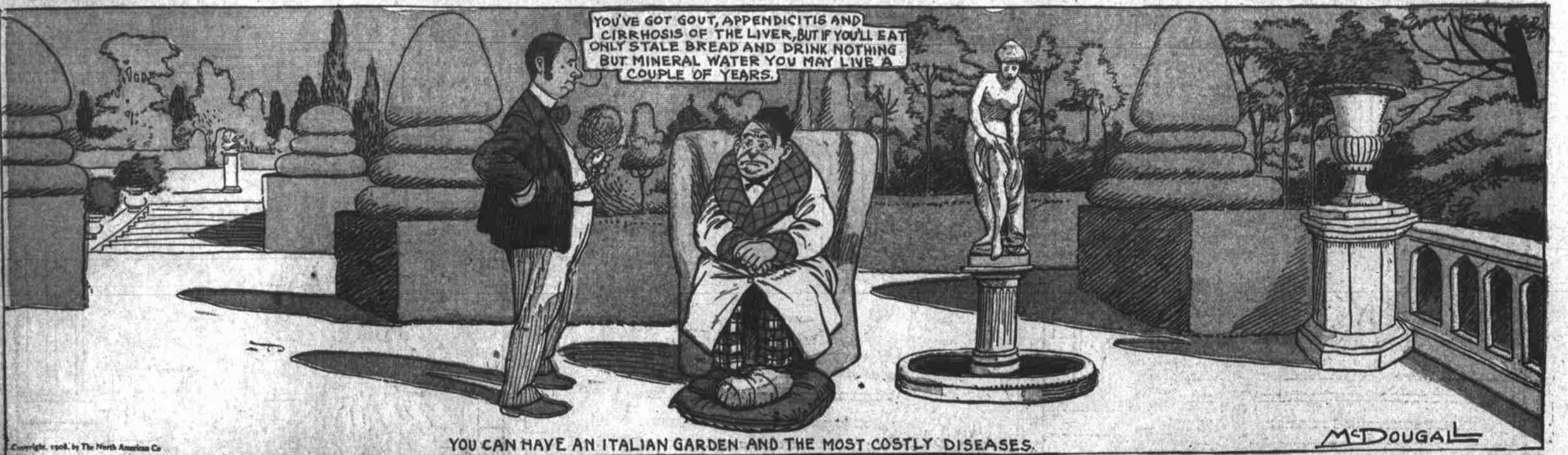
YOU CAN HAVE AN ITALIAN GARDEN AND THE MOST COSTLY DISEASES.