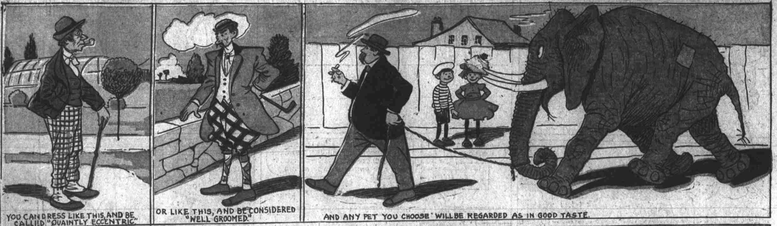
YOU CAN DRESS LIKE THIS, AND BE CALLED "QUAINTLY ECCENTRIC."