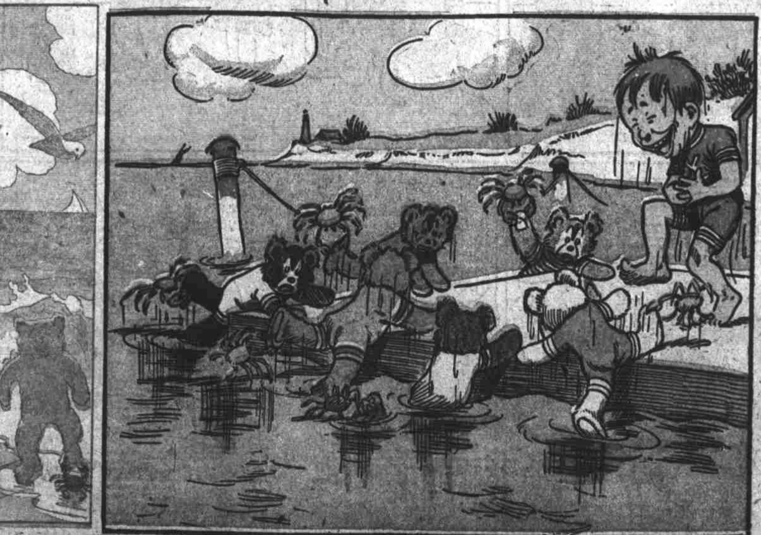
5. A moment passes then the ocean Is all a-splash with great commotion— Each Ted is terrified, and grabs For something to beat off the crabs.