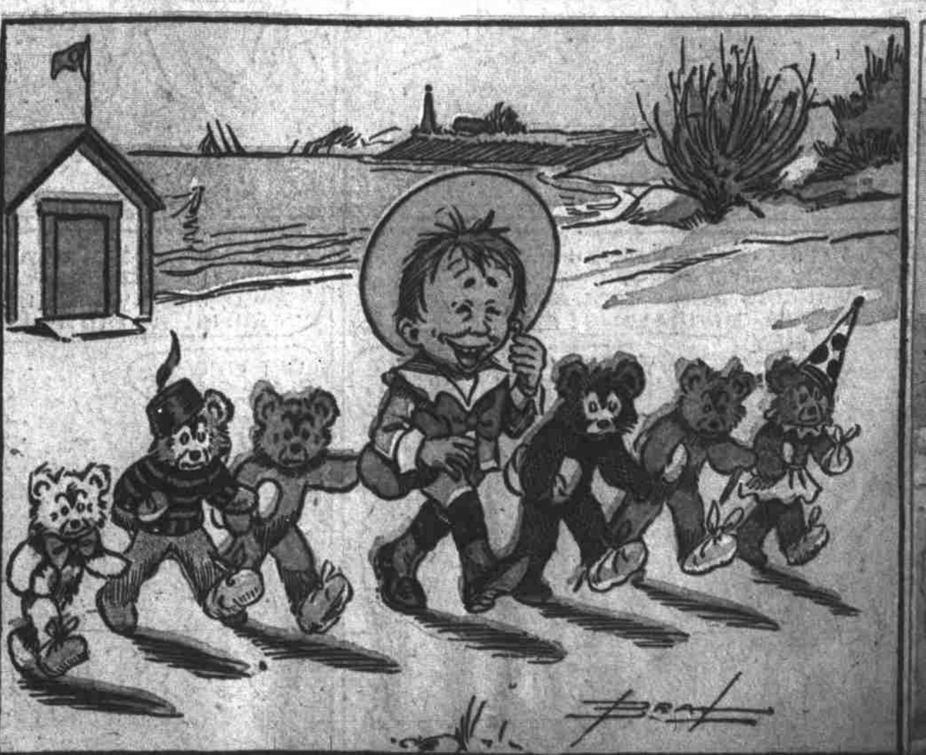
6. You see here six small faces glum, While one alone is smiling some, By looking closer you will see The queer foot on each Teddy B.