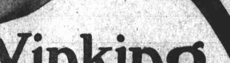
W. E. Harknell & Co., dry goods, clothing and shoes, 280 to 284 East Morrison street.