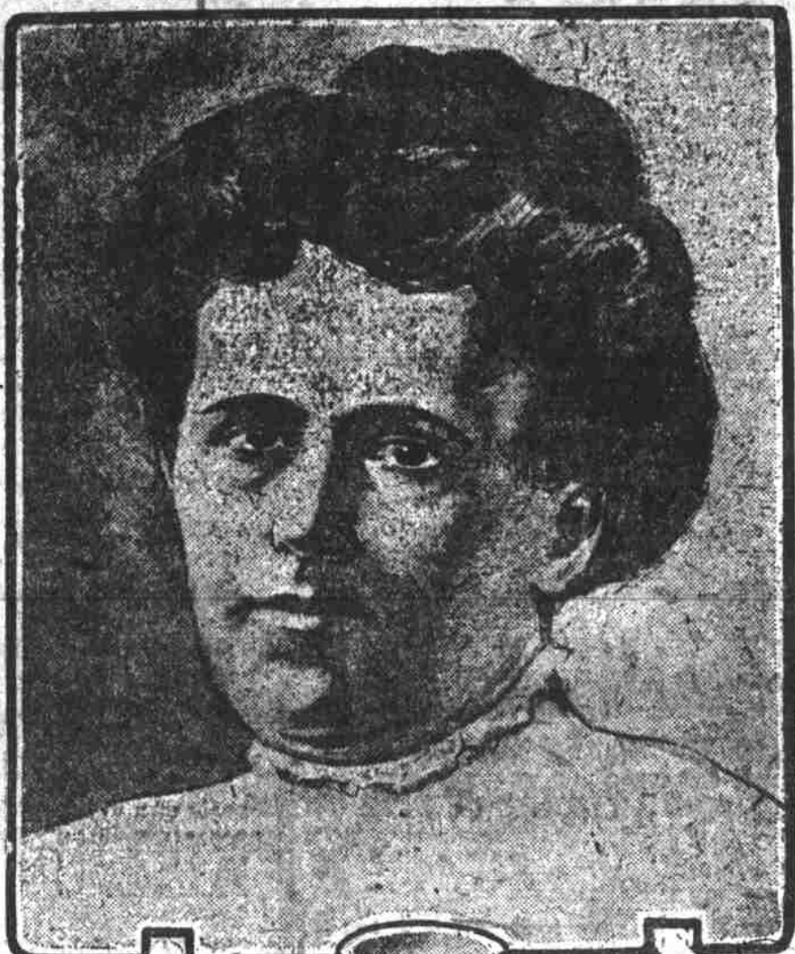
Mrs. Belle Guinness, Murderer Who Owned the La Porte Farm Where Many Persons Were Slaughtered.