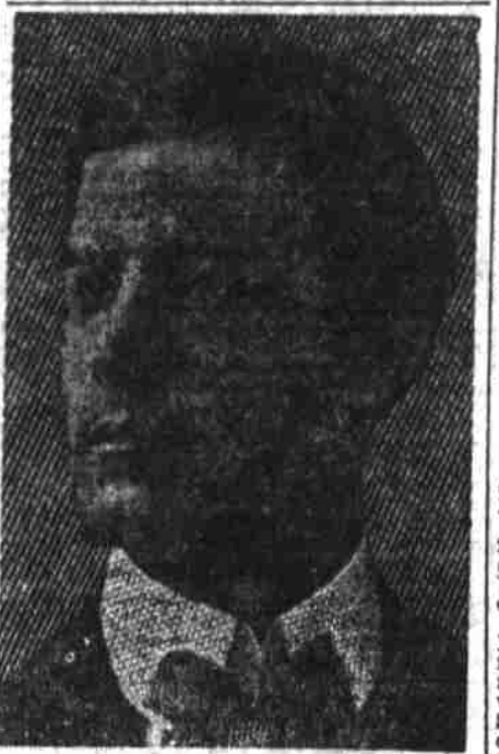
Captain Richmond Pearson Hobson.

Captain Richmond Pearson Hobson, the present congressman from the state of Alabama, will give a lecture at the Heilig theatre, fourteenth and Washington streets, tomorrow night, May 1, on "National Defense."