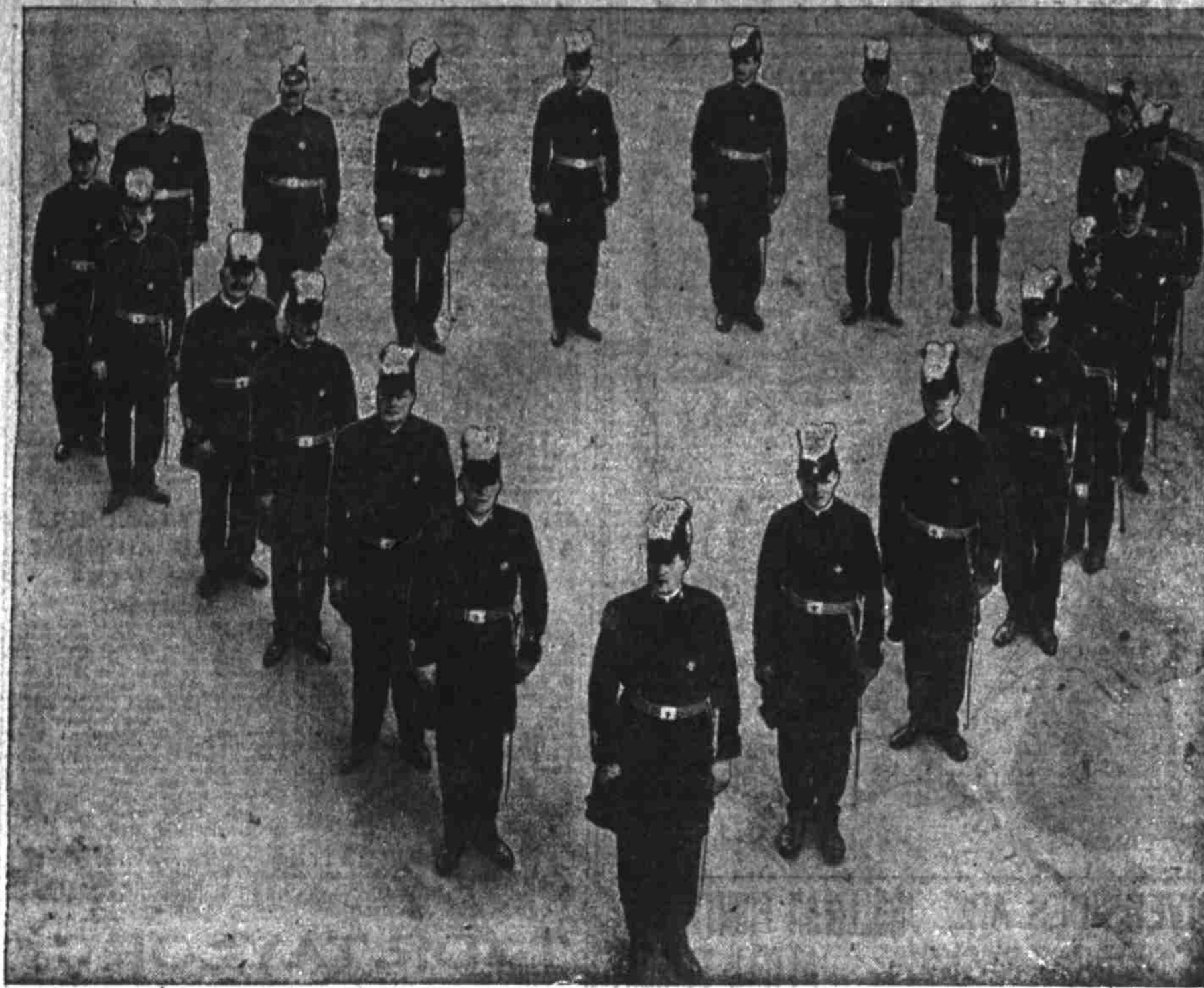
One of the Formations Shown in Evolutions by Crack Team.

The grand charity ball to be given by the Knights Templar in aid of the baby home this evening at the new Masonic temple will be opened by a 15-minute exhibition drill with some of the most intricate Templar movements.