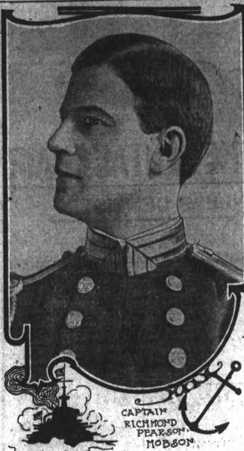
CAPTAIN RICHMOND PEARSON HOBSON

Next Friday evening, May 1, at the Helix theatre, Fourteenth and Washington streets, Captain Richmond Pearson Hobson, congressman from Alabama, will deliver his famous lecture on "National Defense." This will certainly be a most timely subject, occurring as it does on May 1, the day Admiral Dewey and his brave men won their glorious victory in Manila bay, and the fact of the big fleet of warships in the Pacific ocean.