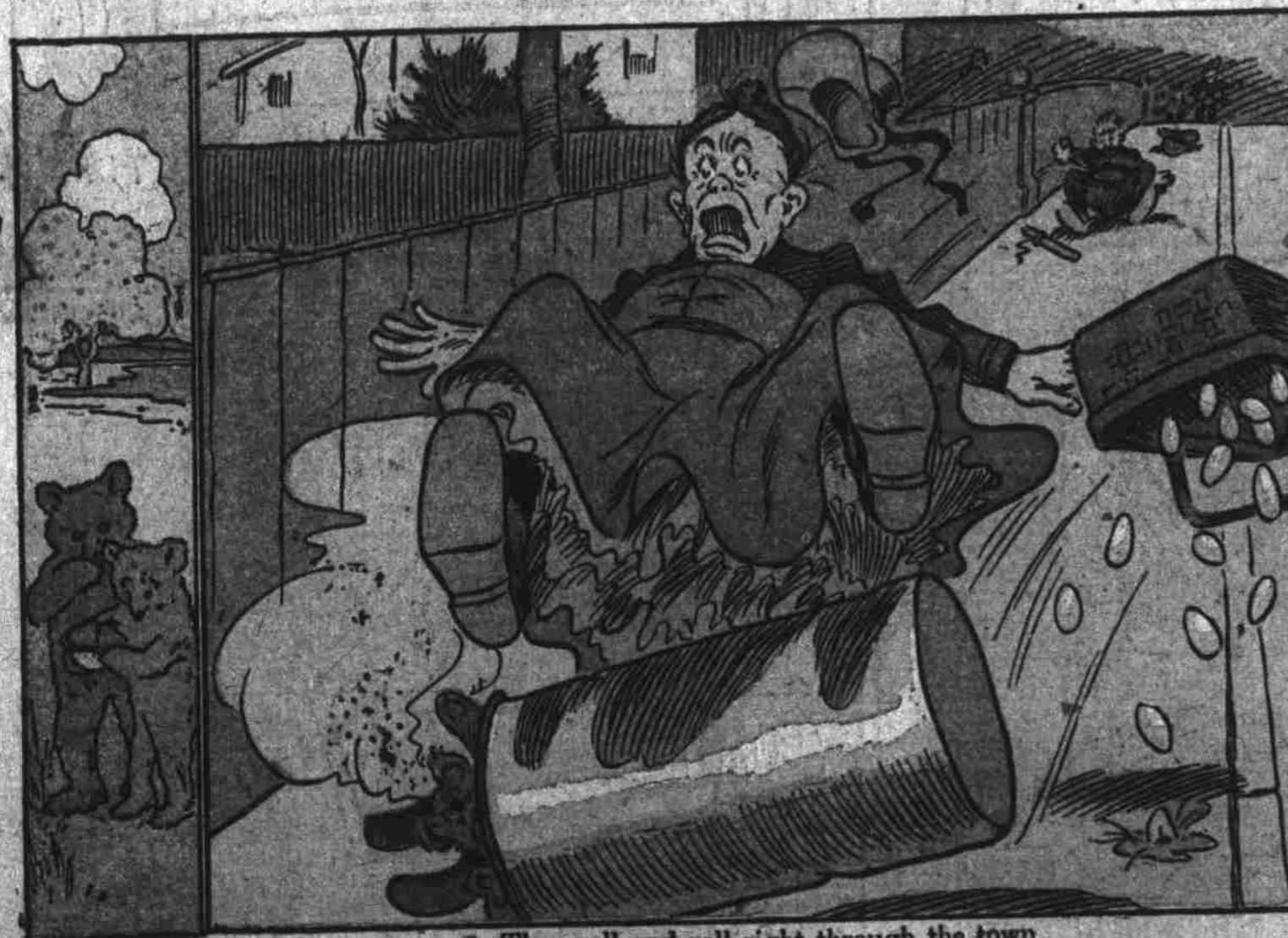
5. They roll and roll right through the town And knock an Irish woman down; She joins the policeman, wild with wrath, And follows quick the Teddy's path.