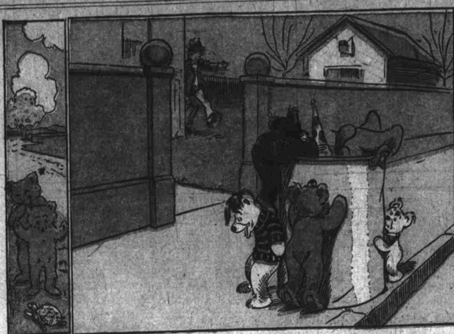
1. The Teds believe that Johnny's tricks Have often left them in a fix— They hold a council and decide That they will run away and hide.

PORTLAND, OREGON, SATURDAY EVENING, APRIL 27, 1908