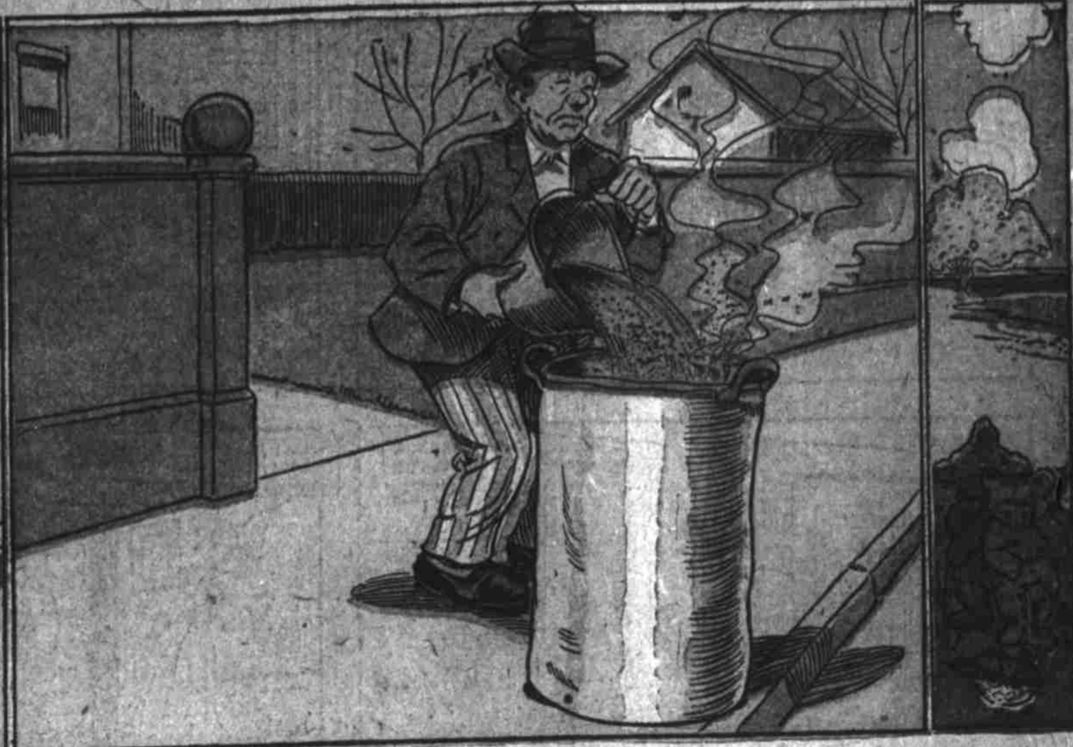
2. They laugh together, cuddled tight Within an ash-can out of sight— They cannot see, which surely rash is, That Thomas comes to empty ashes.