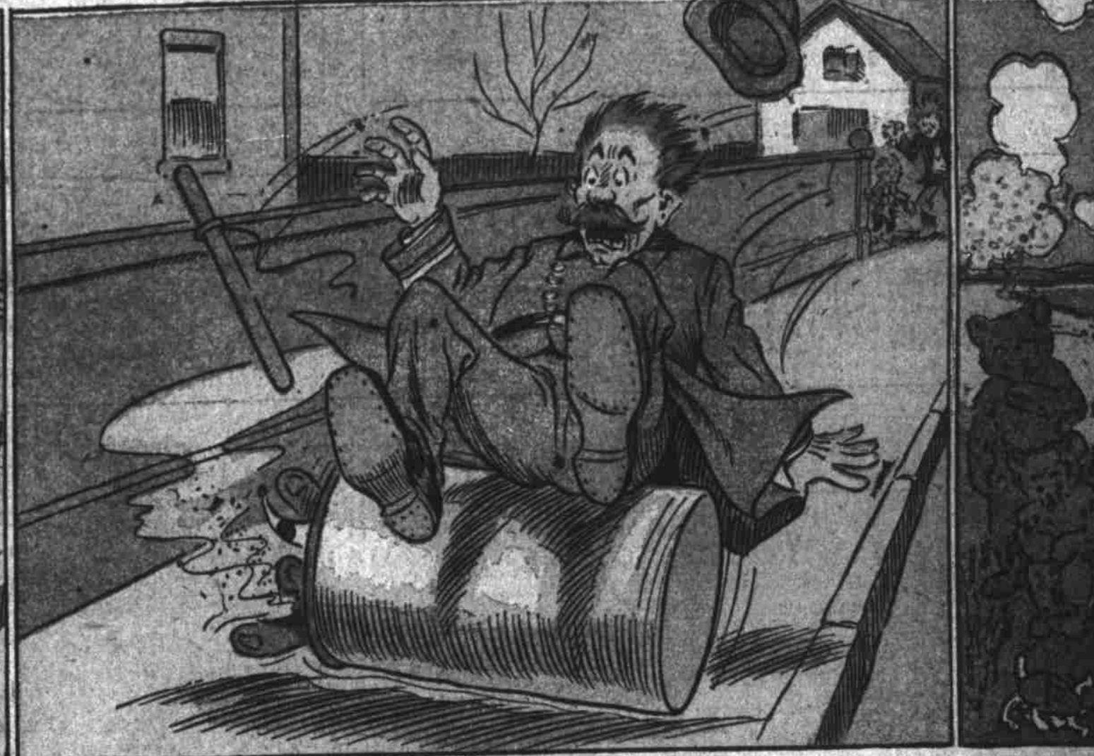
4. They roll and roll along the street And knock a policeman from his feet— They hear the threatening, angry man, And wish they'd never seen the can.