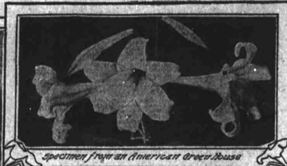
Specimen from an American Greenhouse