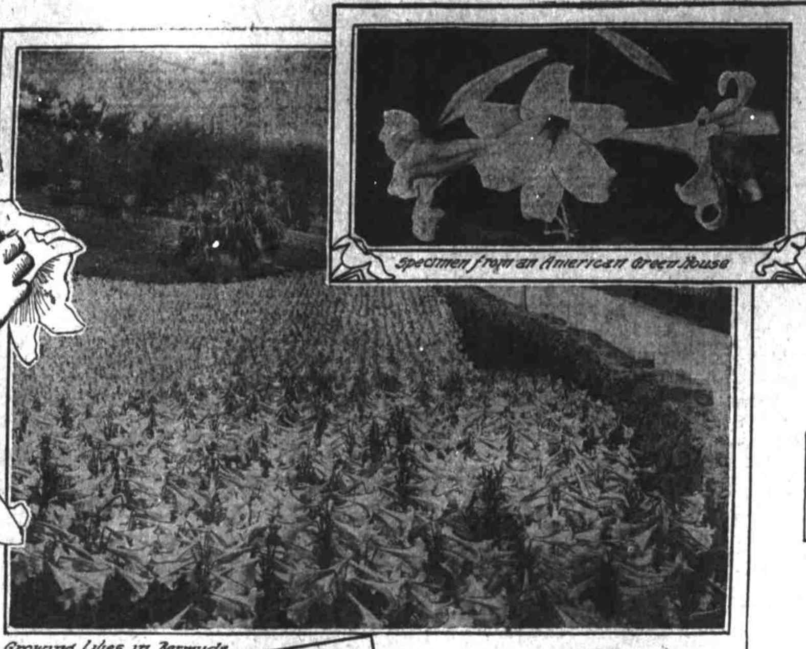
Growing Lilies in Bermuda