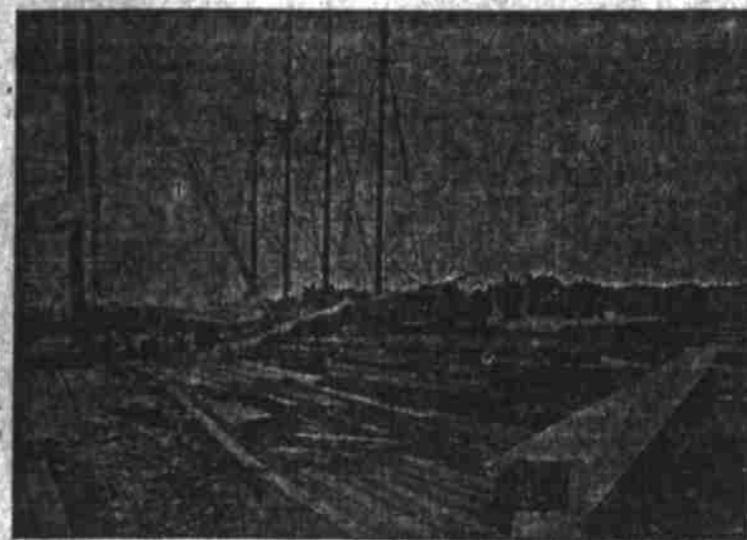
BANDON LUMBER YARD ON THE WORLD.

is one of the best in the state; a well-equipped public library, all church denominations are well represented, and other advantages which help to make a home town, together with the delightful climate, both winter and summer, combine to make Bandon-by-the-Sea just the place for those who are seeking the ideal home city, as well as the most opportune place for business openings and manufactories.