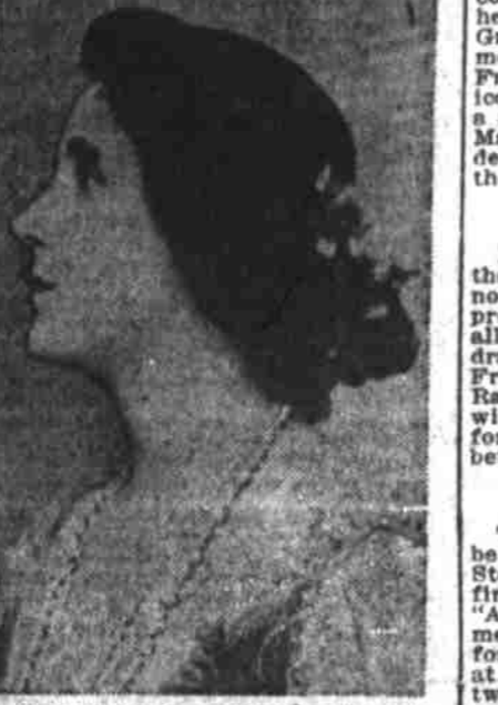
Mrs. Patrick Campbell, Who Appears at the Hellig Tonight.

Mrs. Patrick Campbell Tonight. The attraction at the Hellig theatre, Fourteenth and Washington streets, tonight and tomorrow night will be the