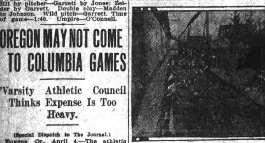
Scene Within the Flying Yard. Bevy of Imported Homers Basking in the Sun.