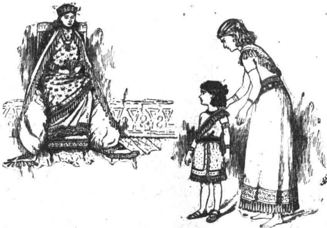
"THEY SHOWED HIM THE QUEEN."

Now all of the wonderful things that befell At the end of the journey, I really can't tell, For the time, if we tried it, would fail us. Each room in the palace was big as a church And although for a window in vain you might search, There were portals a score, And beside every door Such a great winged bull as delighted of yore The mighty King Sardanapalus.