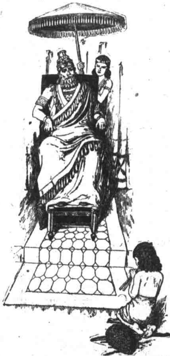
"QUITE AS SWEET TO AN EARLY ASSYRIAN EAR AS THE MUSIC OF BACH OR BEETHOVEN."

But even a king may grow weary in time Of a royal amusement, however sublime, And now by the river he halted; His bow was too heavy, his arrows were dull, His fan-bearers served but the breezes to lull; The flies they were rude, And the sun would intrude, And in short his Assyrian Majesty's mood Scarce befitting a rank so exalted!