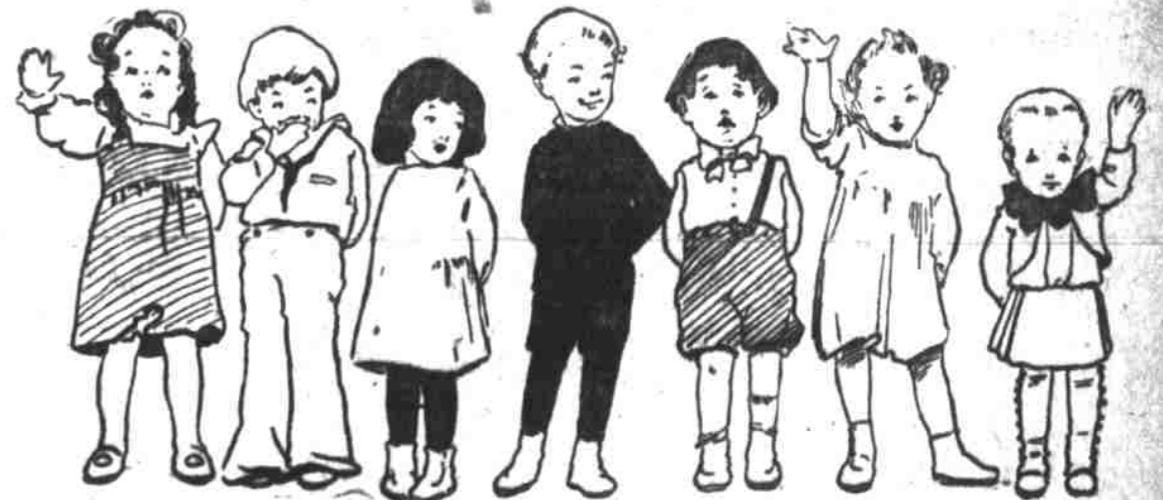
THE SPELLING CLASS.