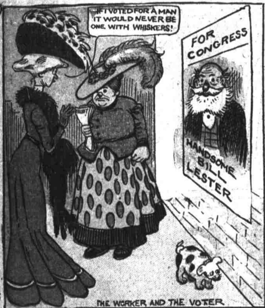
THE WORKER AND THE VOTER