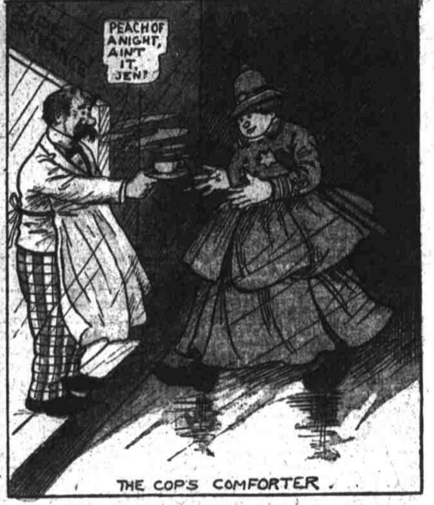
THE COP'S COMFORTER