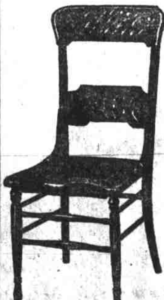
This fine Solid Oak Chair, Boston Leather Seat, Special this week...$1.95