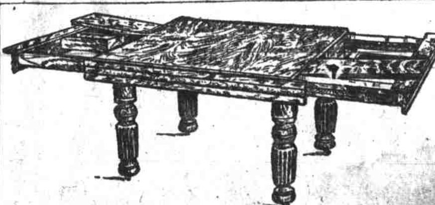
This Solid Oak 6-foot Extension Table; top has compartments to hold the leaves; also lined compartment for your silver. A regular $22 value. Special this week.....$15.50