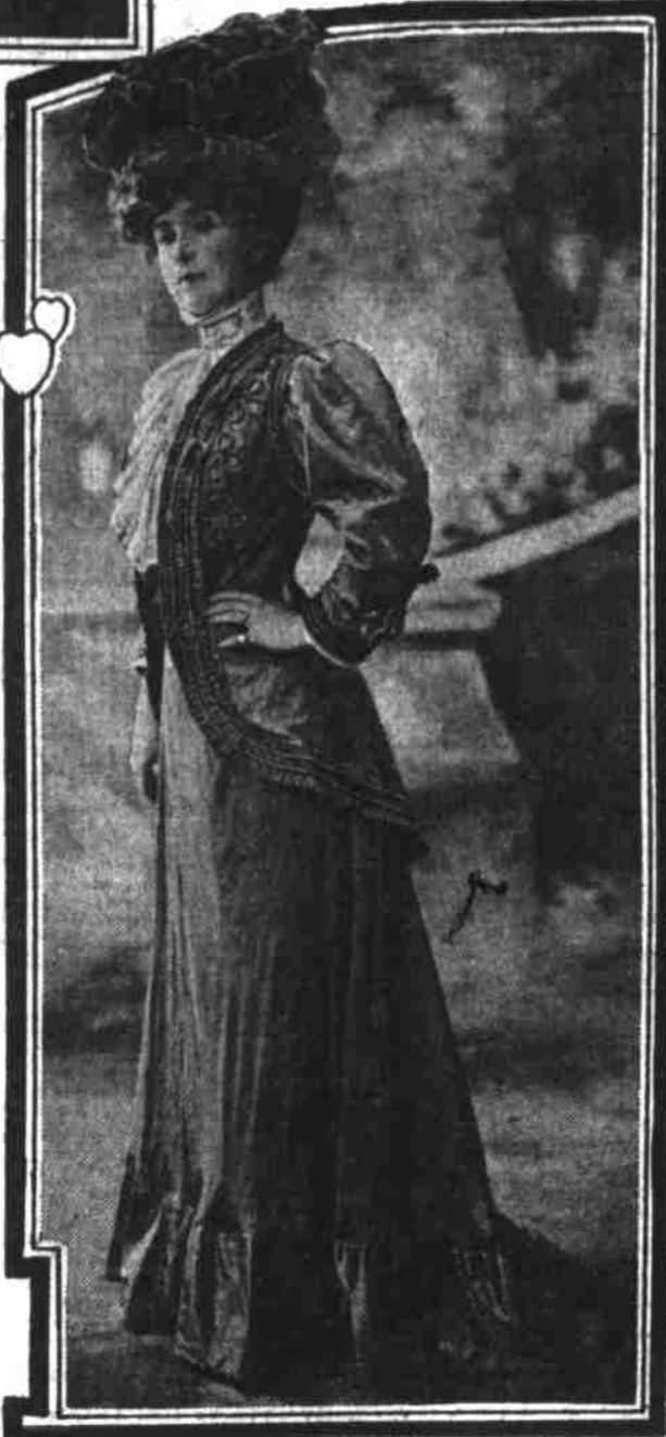
A spring tailored costume by Dreccoll. The little cutaway jacket is of taffeta silk. The skirt is voile, with a wide band of taffeta at the foot.

Diagonal serges and worsteds, as usual, hold their own, for nothing so fits in with the variation of all climates as these lightweight but comfortable materials.