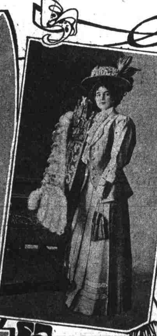
Amethyst herringbone chevron trimmed with silk and buttons of same shade.