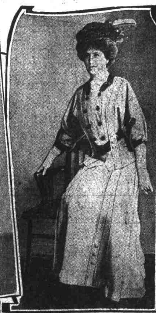
Modified Norfolk jacket of apricot Panama trimmed with patent leather and folds of striped silk with brass ornaments.