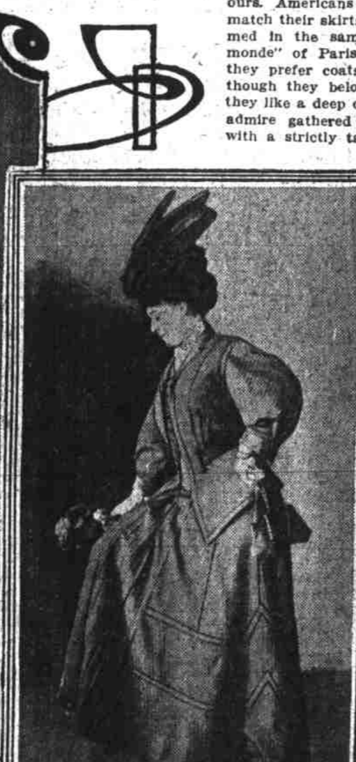
New belted coat of dark material with silk stripe in darkest shade. Cut skirt with bias strappings.