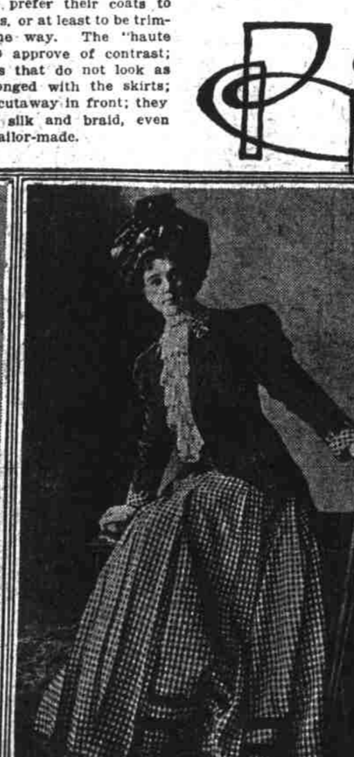
Light-weight shepherd's plaid skirt with coat of black broadcloth.