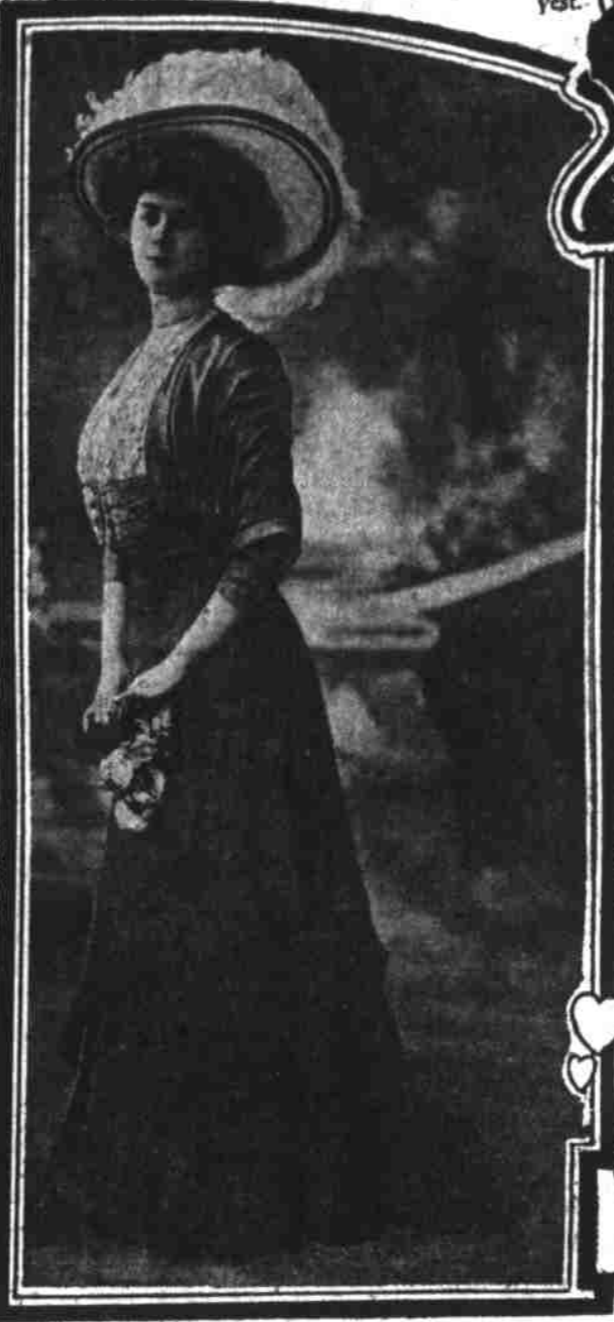
Costume in cashmere de soie, by Dreccoll. This idea can be carried out in many shades of beige, peacock blue and green.