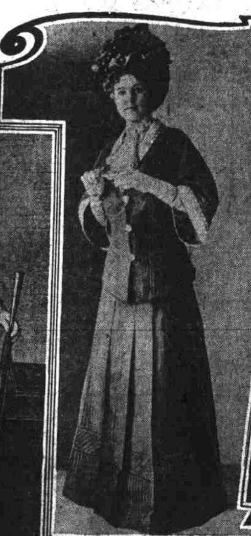
Plain chevron with invisible stripe trimmed in tan cloth.