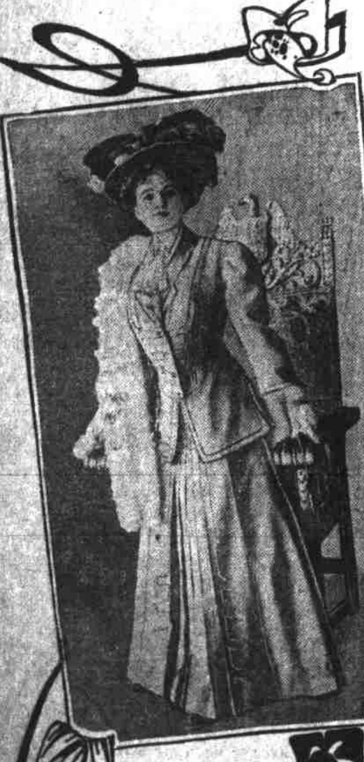
Champagne colored panama trimmed in flat silk braid of same shade piped with fancy braid. Collars and cuffs of plain taffeta.

Blue herringbone serge is very popular, and a new material called chevron in which the stripes are not parallel, but