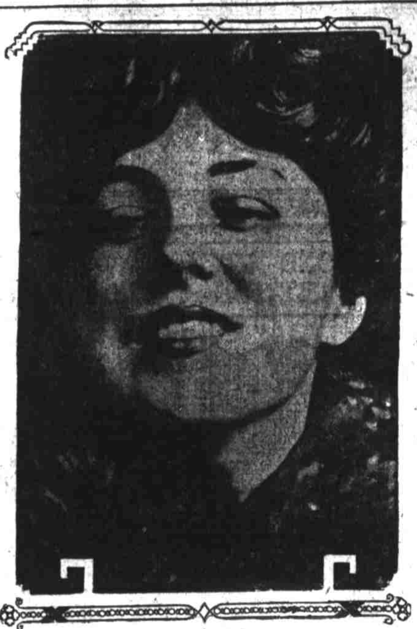
This picture is from a snap shot of Mrs. Evelyn Nesbit Thaw, and was taken on a recent visit to Matteawan. Mrs. Thaw has filed papers in a suit for the annulment of her marriage to Harry K. Thaw on the grounds that he was insane at the time the marriage was contracted.