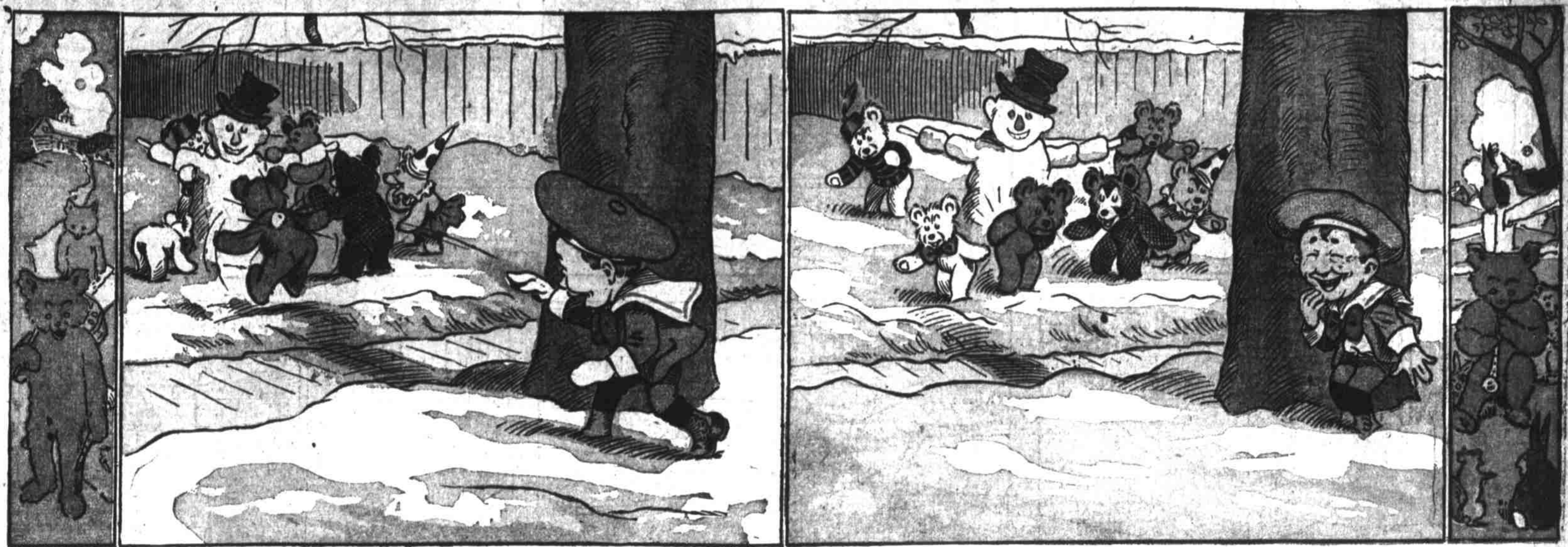
1. The Teddy Bears were hard at play When Johnny chanced to pass that way. They were so busy and intent They never noticed where he went.

PORTLAND, OREGON, SATURDAY EVENING, MARCH 21, 1908