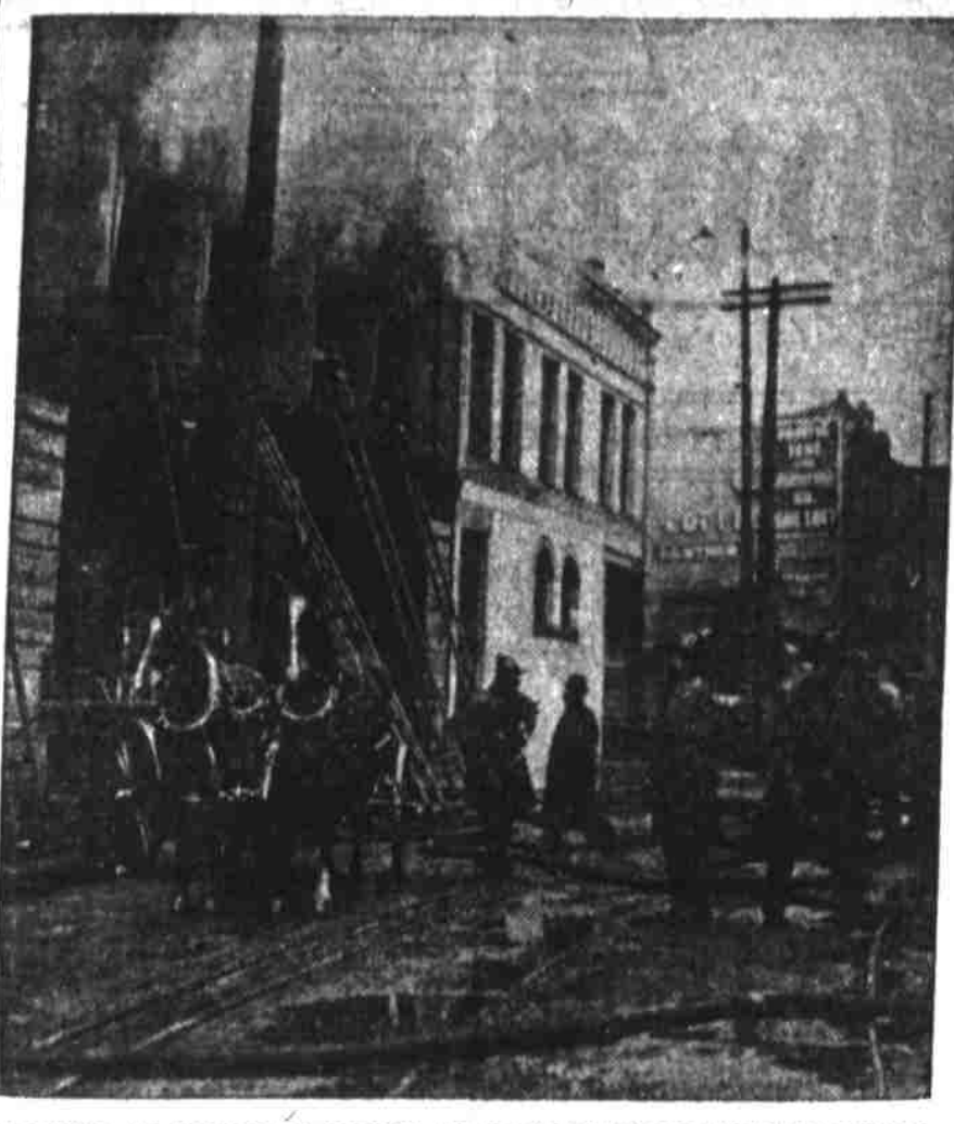
FIREMEN AT WORK IN FRONT OF PACIFIC COMPANY'S BUILDING.