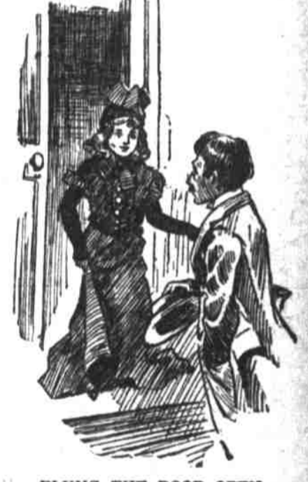
FLUNG THE DOOR OPEN

And THEN what did the kind artist do but take her on a good, long automobile ride! You see, he had left the car right outside the gate. Enjoy herself? Why, she had one of the best times of her life. And you may be sure that she didn't regret in the least her absence from the party.