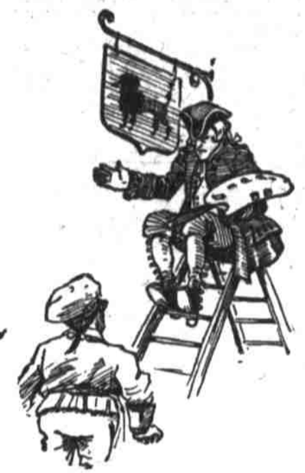
"SHALL I PAINT A CHAIN?"

"WILL you provide me with dinner and lodging for the night?" The landlord of the Black Poodle Inn looked doubtfully at the speaker, imagining, from the shabby appearance of the traveler, that he was without money, and therefore was