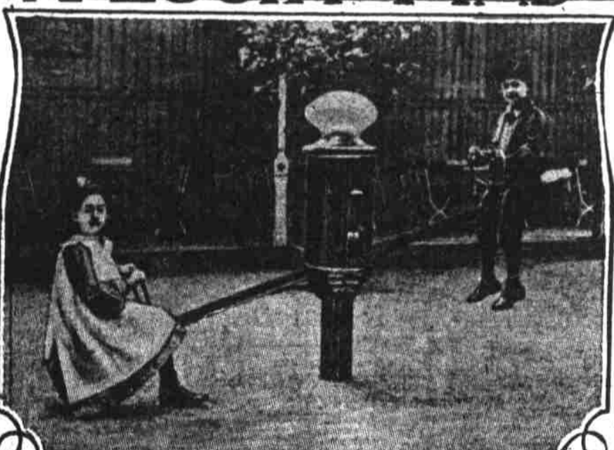
"THEY PLAYED SEE-SAW"

"I ONLY wish we had as much money as those rich Americans," sighed Carmina, casting envious eyes at the handsome villa owned by the Americans.