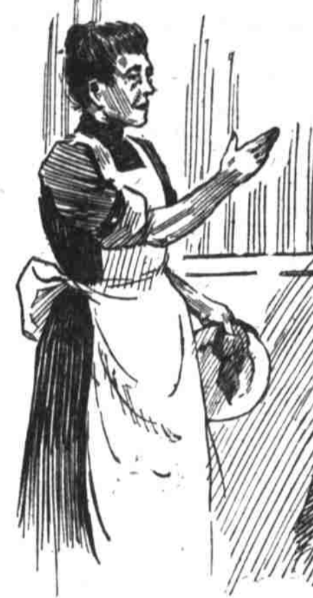
WONDERFUL TALES ABOUT BANSHEES

Michael was overjoyed. He gratefully murmured his thanks, whereupon St. Patrick mysteriously disappeared