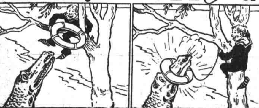
"WONDERFUL ESCAPE OF SAILOR JACK"

No sooner did he reach home than Pietro dutifully gave the coin to his mother. She made no comment, but when the father came home that afternoon the two had a long talk together, at the end of which Pietro's father said: "Children, there is a holiday in the city tomorrow. You have been a good little