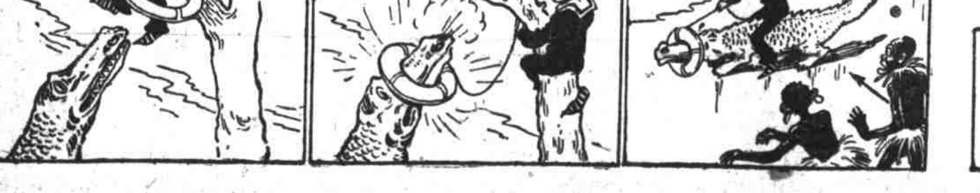
WONDERFUL ESCAPE OF SAILOR JACK