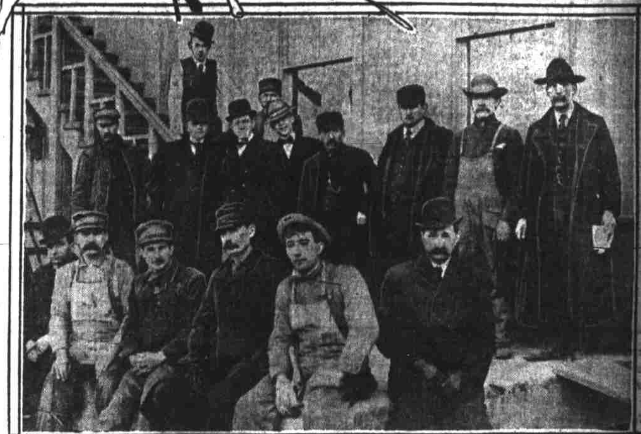
Yard Crew of the Northwestern that Began the Great Swear-off