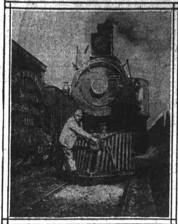
Where Sober Brains are Needed

A HEAD-ON collision has occurred between the whisky bottle and the railroads of the country.