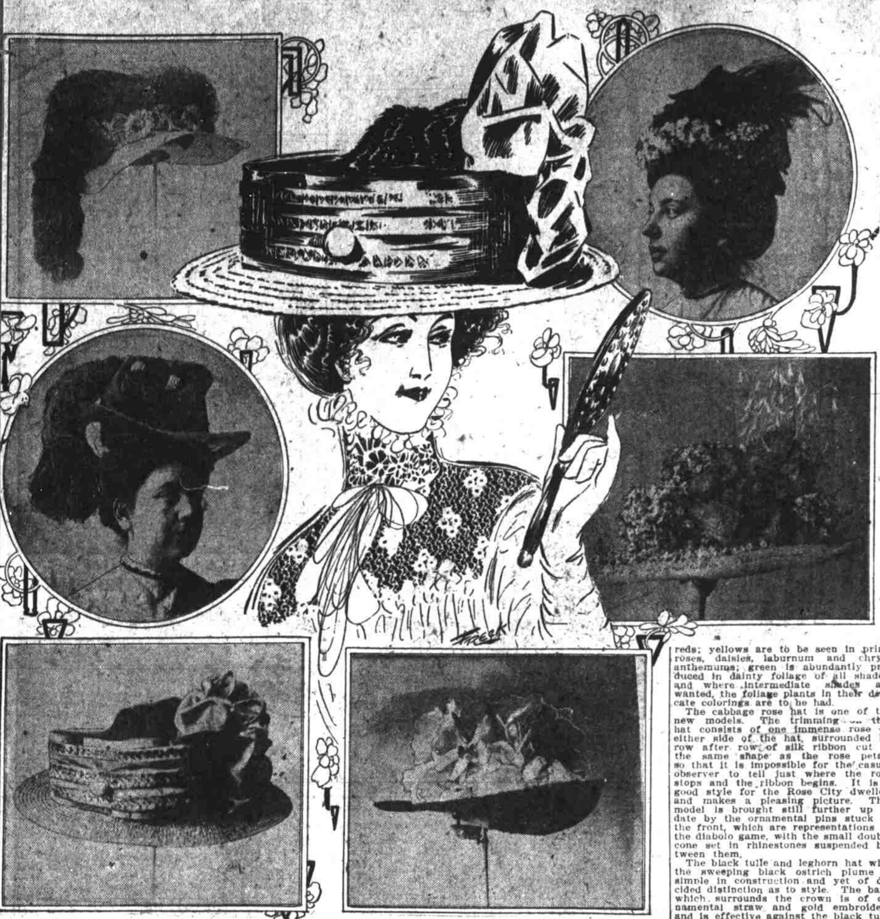
A FEW OF MANY PRETTY SPRING CREATIONS DISPLAYED BY PORTLAND WHOLESALEERS.