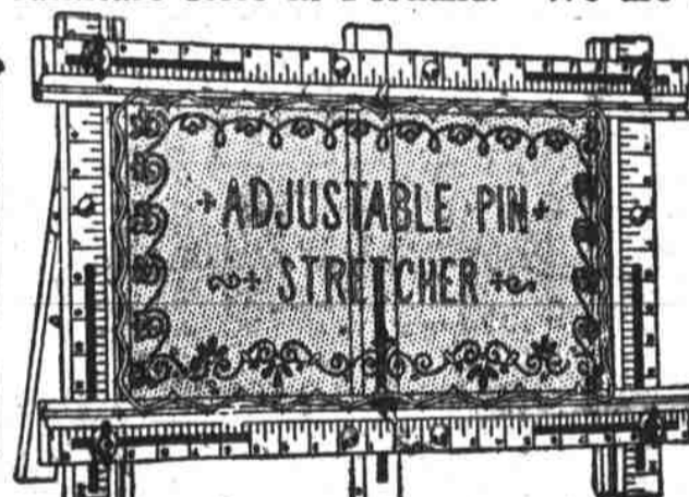
This Adjustable Curtain Stretcher, just like cut. Pins are self-adjusting; has easel back. Trust price $3.50. Our price, special, $1.75