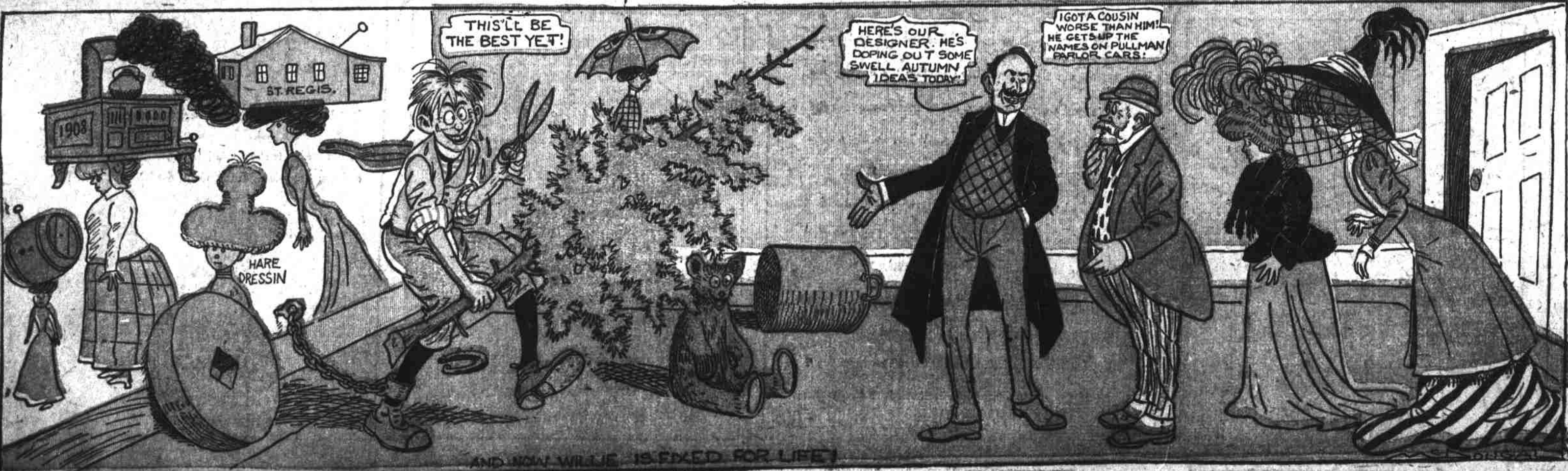
AND NOW WILLIE IS FIXED FOR LIFE!