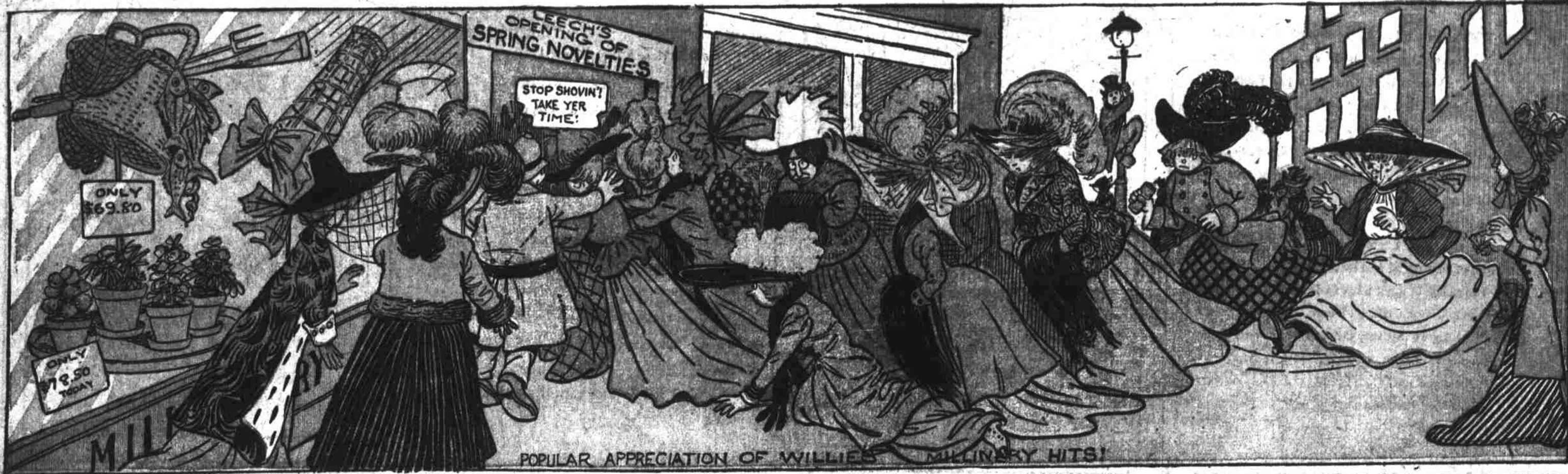
POPULAR APPRECIATION OF WILLIE'S MILLINERY HITS!

Copyright, 1908, by The North American Co.