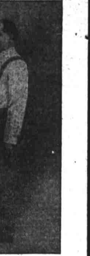
Positive Proof in Pictures