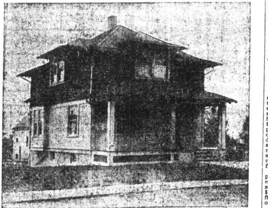
Oakley Residence, East Sixteenth Street, Between Going and Wygant.