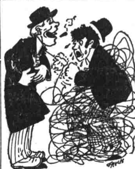
"Keep a Pullin' Pal—There's More."

Fidgety people are always peculiar. He was a little fidgety sort of a fellow. He was particularly nervous. He was a great talker. When in conversation with a friend he had a habit of invariably picking a hair from the other fellow's coat collar. Or he would flip an imaginary speck from the shoulder of the one he was talking with. It was all a habit. It annoyed all his friends, but none of them had the nerve to tell him of the fact. They would brush their clothes thoroughly when they knew they were going to meet the man with the fidgety habits. But it was of no use. The fidgety one continued to pick and flip the imaginary specks or bits of thread from the other person's coat. The man with the habit showed up at the Hotel Portland the other day. One of his friends—perhaps it was one of his enemies—knew that the fidgety guy was to be there. So they met. The fellow who didn't like the fidgety guy had a little innocent piece of thread protruding from his buttonhole. He pulled it out and held it out prominently. The two began to talk. The conversation had hardly commenced when the fidgety one reached for the little piece of thread. He picked it. More came through the buttonhole and he pulled it. Thread came from the coat lapel by the yard. The fidgets was determined and