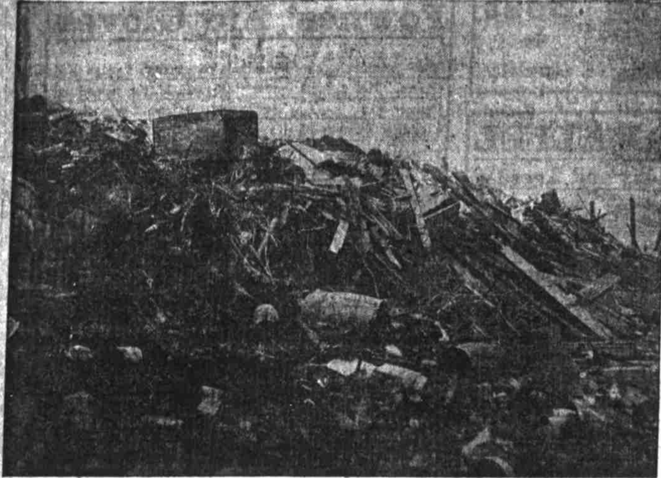
Over Two Acres of Ground Near the Crematory Are Used as a Dump for the Surplus Which the Incinerator Is Too Small to Handle.

Pressing need of a new and modern crematory is emphasized by the huge pile of refuse thrown on the city dump at the city crematory because the facilities are inadequate for burning it. An area equal to two city blocks is covered from six to eight feet deep with paper, broken barrels, scrap iron, boxes and refuse of all kind. Superintendent Daggett says the crematory is not large enough to handle this waste matter and that one furnace would be required to burn all the paper that is now thrown on the dump.