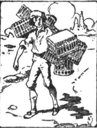
STEPPED FORWARD ALMOST BLITHELY

"Perchance 'tis a wedding," thought he, "and should I take advantage of the