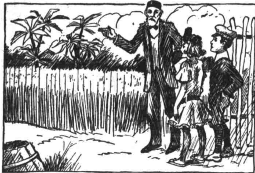
A PLOT OF GROUND DEVOTED TO THE RAISING OF GRAIN

After effecting a landing, the four threaded their way through the luxuriant vegetation. Indeed, had there