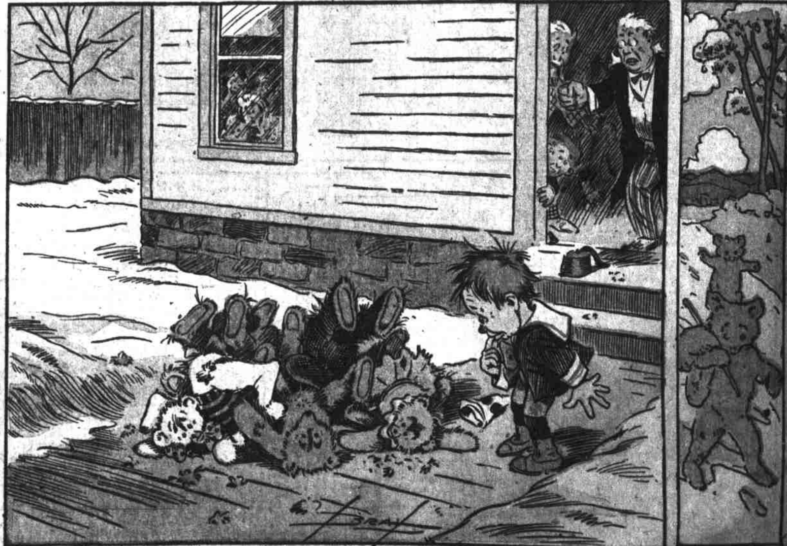
6. Each Teddy bled about a pint— His very life all round was spilling; For you must know a Teddy bear Can't live without his sawdust filling.