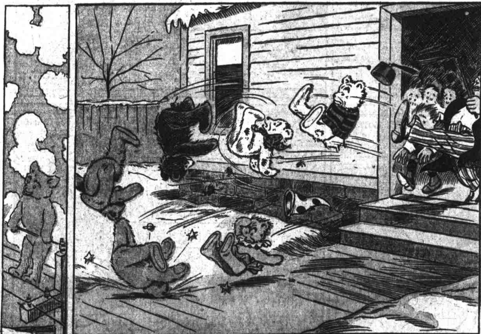
5. Then teacher saw 'twas all a joke; But, stead of laughing, he got mad. He went at those six Teddy bears, And what he did to them was sad.