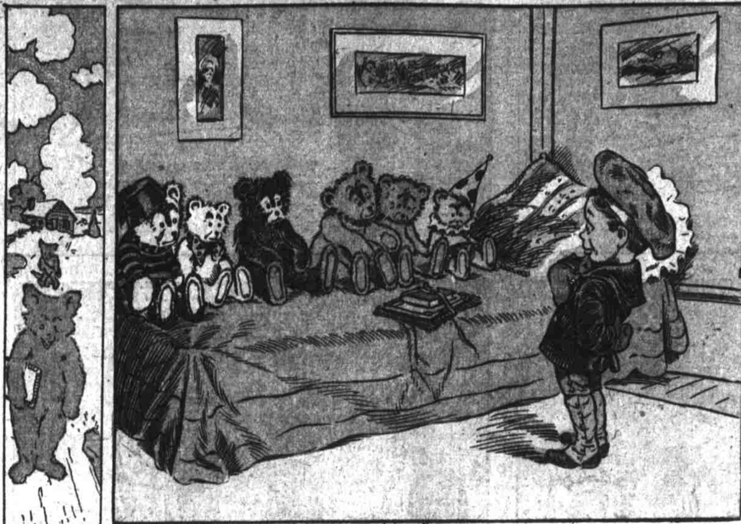
1. "Now, Teddies, you be good—you hear?" Thus warningly spoke little John; "For I am going to school to speak A piece about George Washington."

PORTLAND, OREGON, SATURDAY EVENING, FEBRUARY 15, 1908