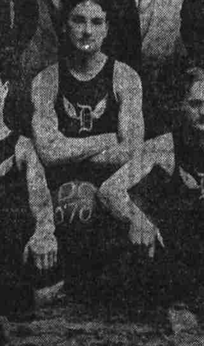
(Special Dispatch to The Journal.) Dallas, Or., Feb. 8.—The victorious Dallas college basketball team has played eight contested games since the season opened in December, and has won every game by large scores. All the members are professional players, turned out in recent years. Games played to date, with the scores made are as follows: Dallas 37, Monmouth Normal 12, at Dallas; Dallas 32, University of Oregon 11, at Dallas; Dallas 43, Oregon Agricultural college 11, at Dallas; Dallas 39, Nome Brotherhood team 23, at Dallas; Dallas 59, Willamette university 11, at Dallas; Dallas 34, East Side Athletic club of Portland 14, at