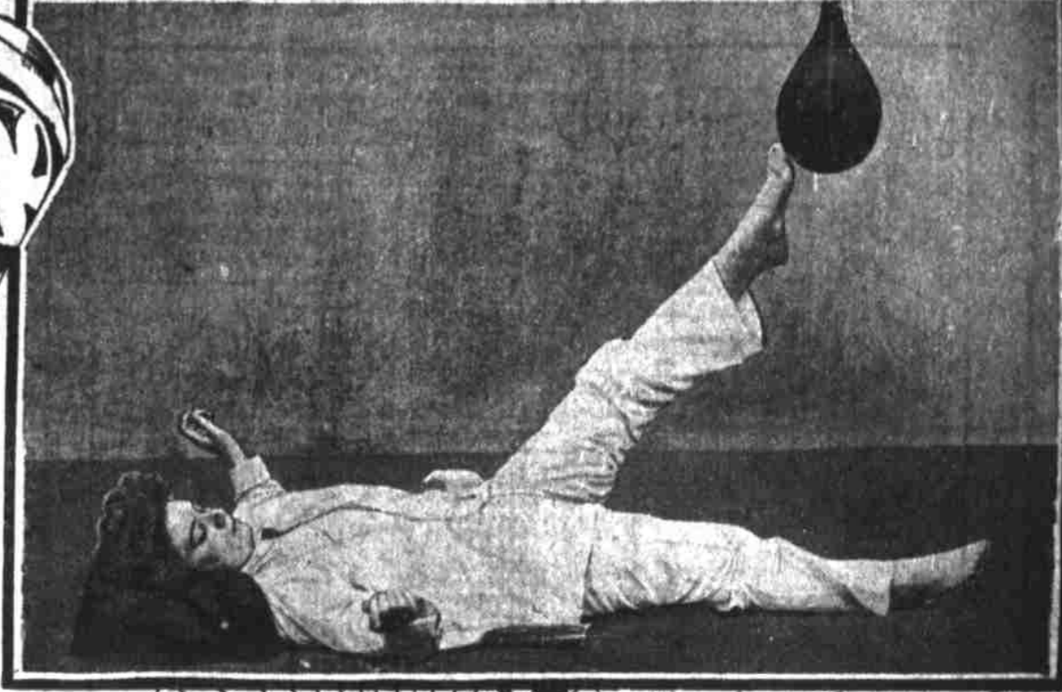
Juggling Foot Ball to Assure Agility

Indeed, the feet exercises have been tried and proved of great benefit to those who show signs of increasing stoutness, and to those who have to sit all day at an office desk.