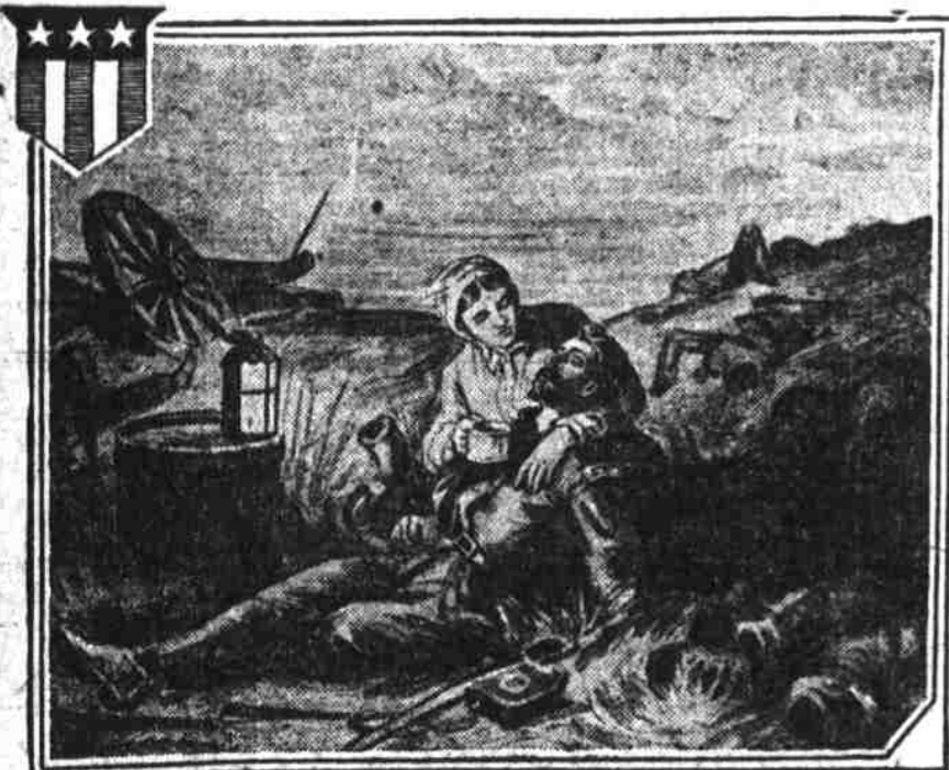
CARING FOR THE WOUNDED

"Who is it that accuses you?" questioned the general.