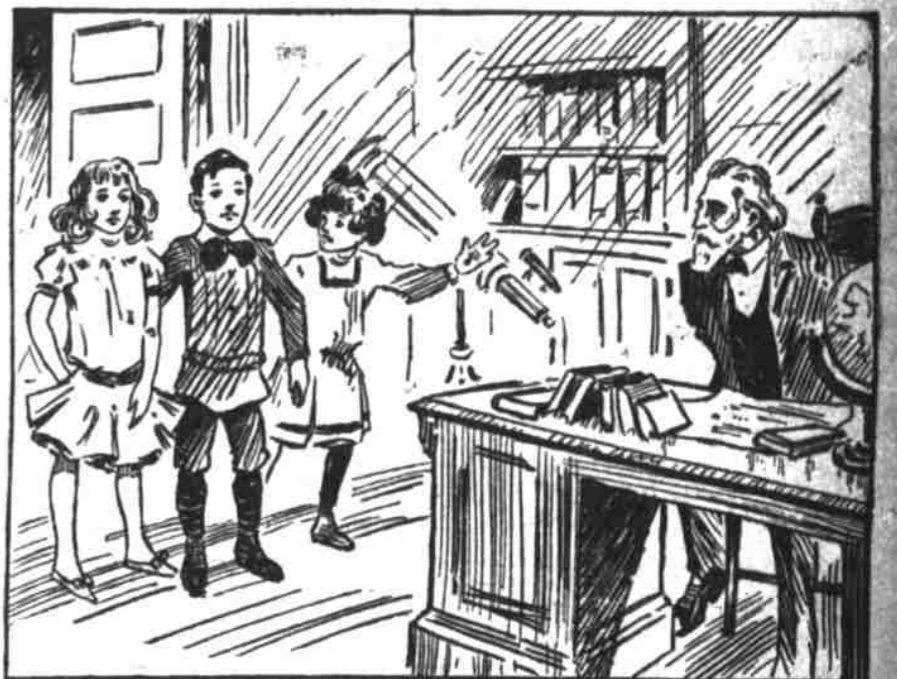
USHERED INTO THE PRESENCE OF PROFESSOR LIVINGSTON

stepped out upon the platform. "When we go out we simply enter the boat here, press another button, and the water pours in and fills the compartment.