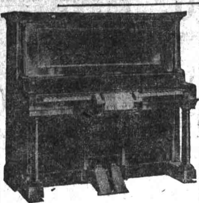
"ARTISTANO" UPRIGHT—Ready to use with roll. A slight movement of the hand simultaneously puts the tracker box and the pedals into place.

THE entire musical world has for years been absorbed in attempts to give the untrained music-lover the command over music enjoyed by the virtuoso.