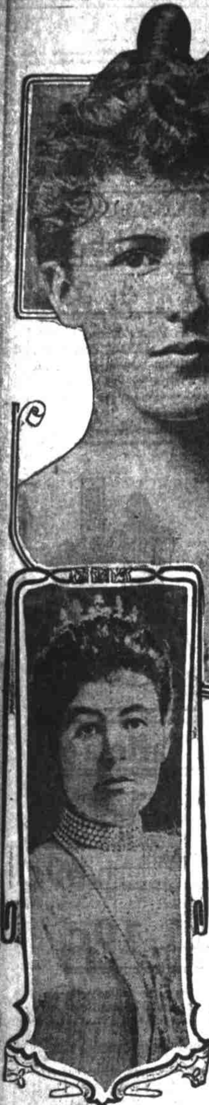
Mr. and Mrs. Alfred Vanderbilt, who finally "accepted" Count Szechenyi for poor little Gladys, who did not want her relatives to be angry with her. Mrs. Cornelius Vanderbilt is shown in the lower picture.